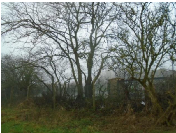
Plate 9.5: Outgrown Hedgerow to South West