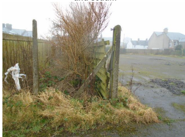
Plate 9.6: Forsythia at the Northern boundary