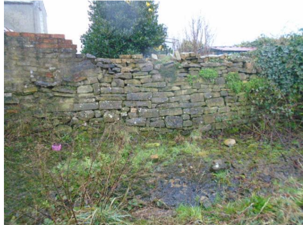
Plate 9.2: Drystone Wall Section to East