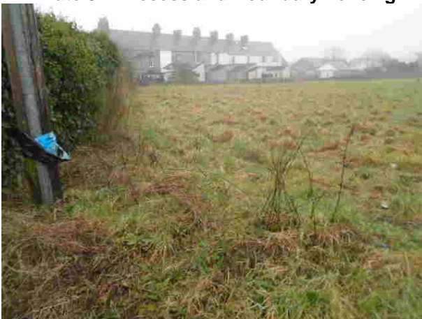
Plate 9.3: Ivy on Boundary Fencing