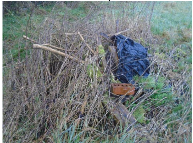
Plate 9.10: Wood and Rubble Pile to West of Site