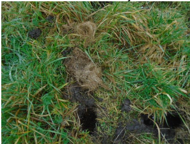
Plate 9.9: Snuffle Marks in the Grassland