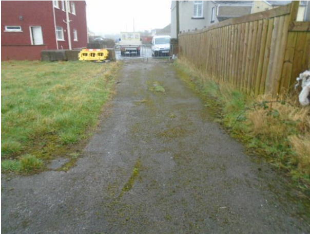
Plate 9.1: Access and Boundary Fencing