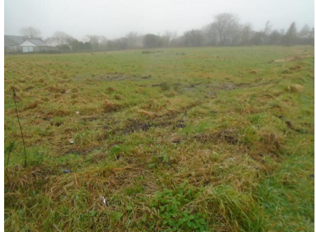
Plate 9.8: Poor Semi-improved Grassland