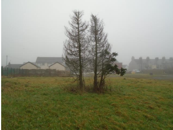
Plate 9.7: Scattered Leylandii