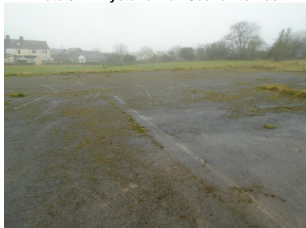
Plate 9.4: Hardstanding with encroaching moss and sedum