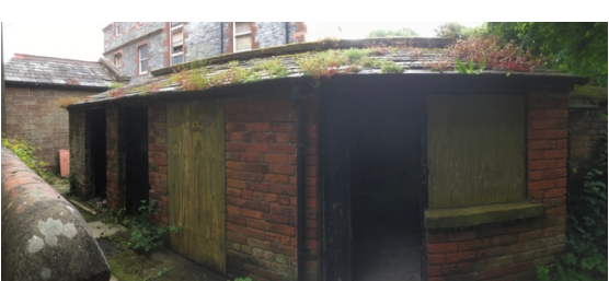
The Old Bank Outbuilding

The proposal is to remove the building retaining the boundary wall and to landscape the area using a mix of providing a back drop for building occupants using social/seating space or artist working outdoors.