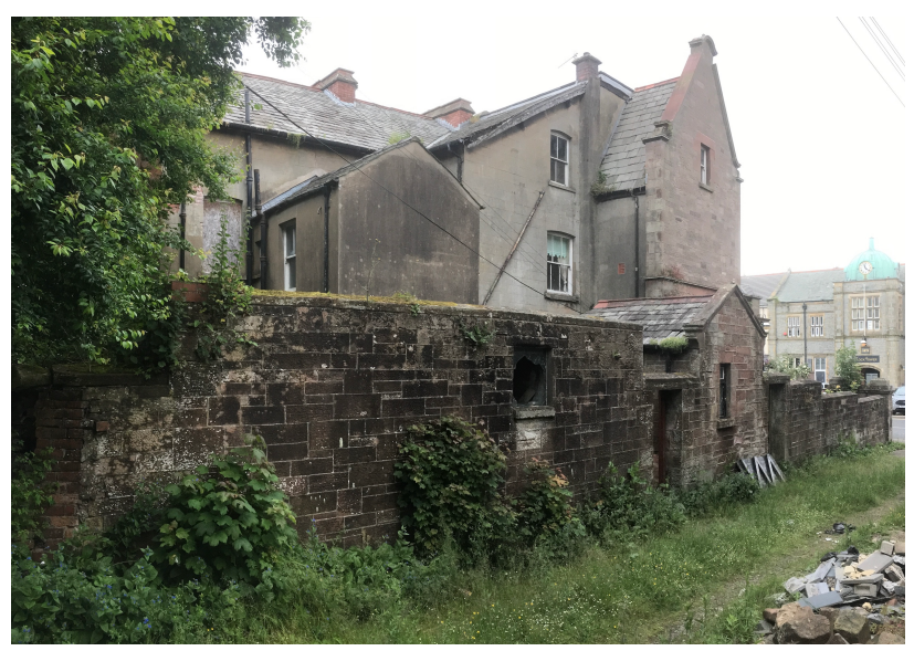
Boundary wall to remain

The proposal is to remove the building retaining the boundary wall and to landscape the area using a mix of providing a back drop for building occupants using social/seating space or artist working outdoors.