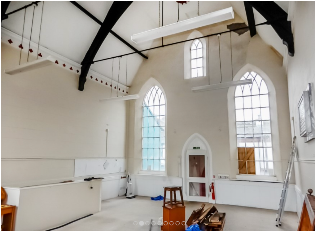
Above photograph showing decorative woodwork and ceiling trusses which will be retained.

The lower floor level which was used as ancillary accommodation (likely tea and coffee serving area and toilet) is sub divided to provide bedroom accommodation and bathroom facilities. This space is already utilitarian in design with no interesting design features.