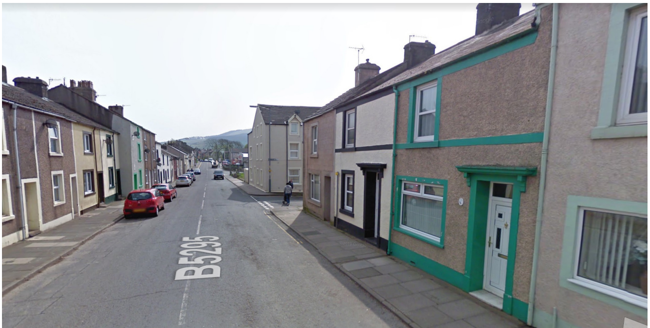
Housing Context Ennerdale Road/Todholes Road Junction