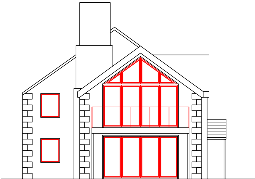
Proposed Side Elevation Scale - 1:100 @ A3