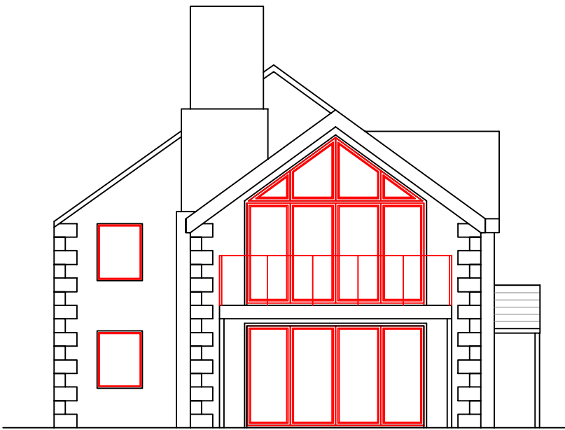
Proposed Side Elevation Scale - 1:100 @ A3