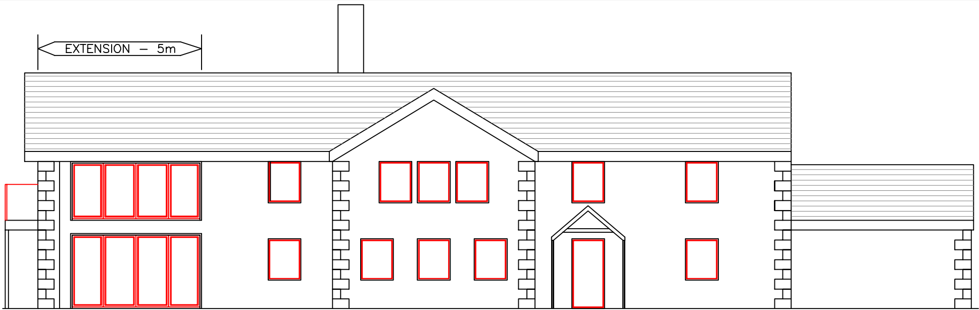
Proposed Front Elevation Scale - 1:100 @ A3