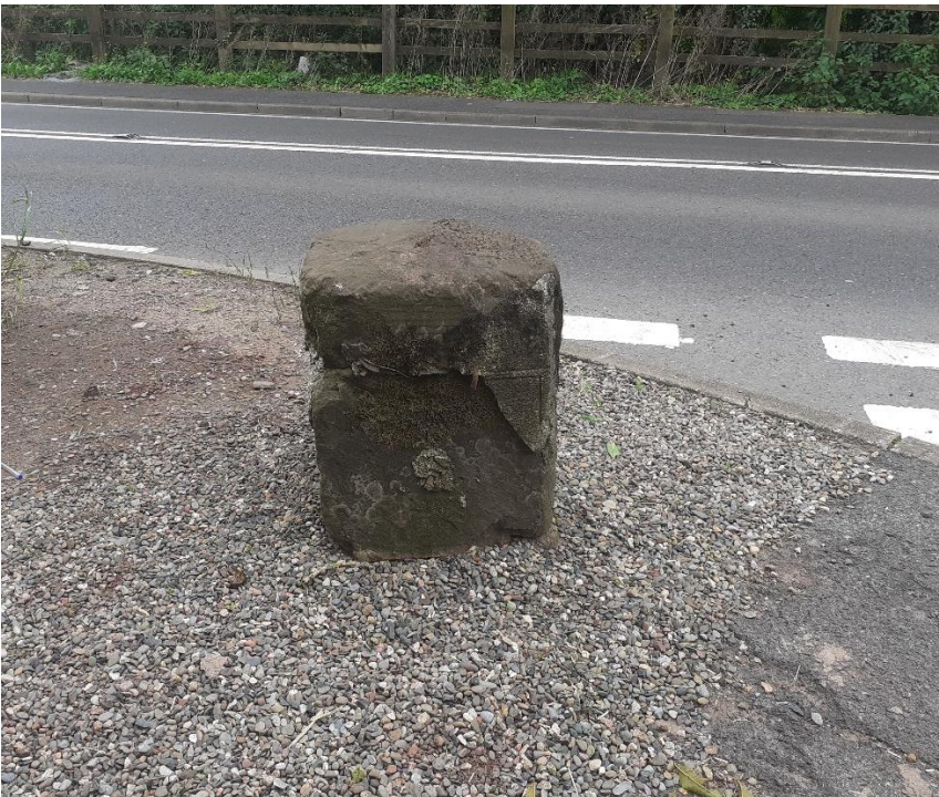
Plate 3: Milestone from north east