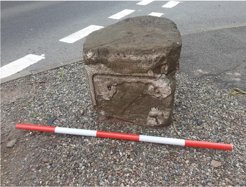
Plate 2: Milestone from south east