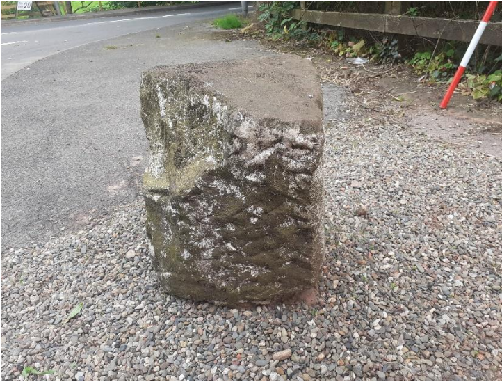
Plate 4: Milestone from north west

2.1.2 The second edition Ordnance Survey (OS) Map shows the Milestone sitting at its current position, and the plaque directions stated, as well guidepost information on the opposite side of the road (Figure 1).