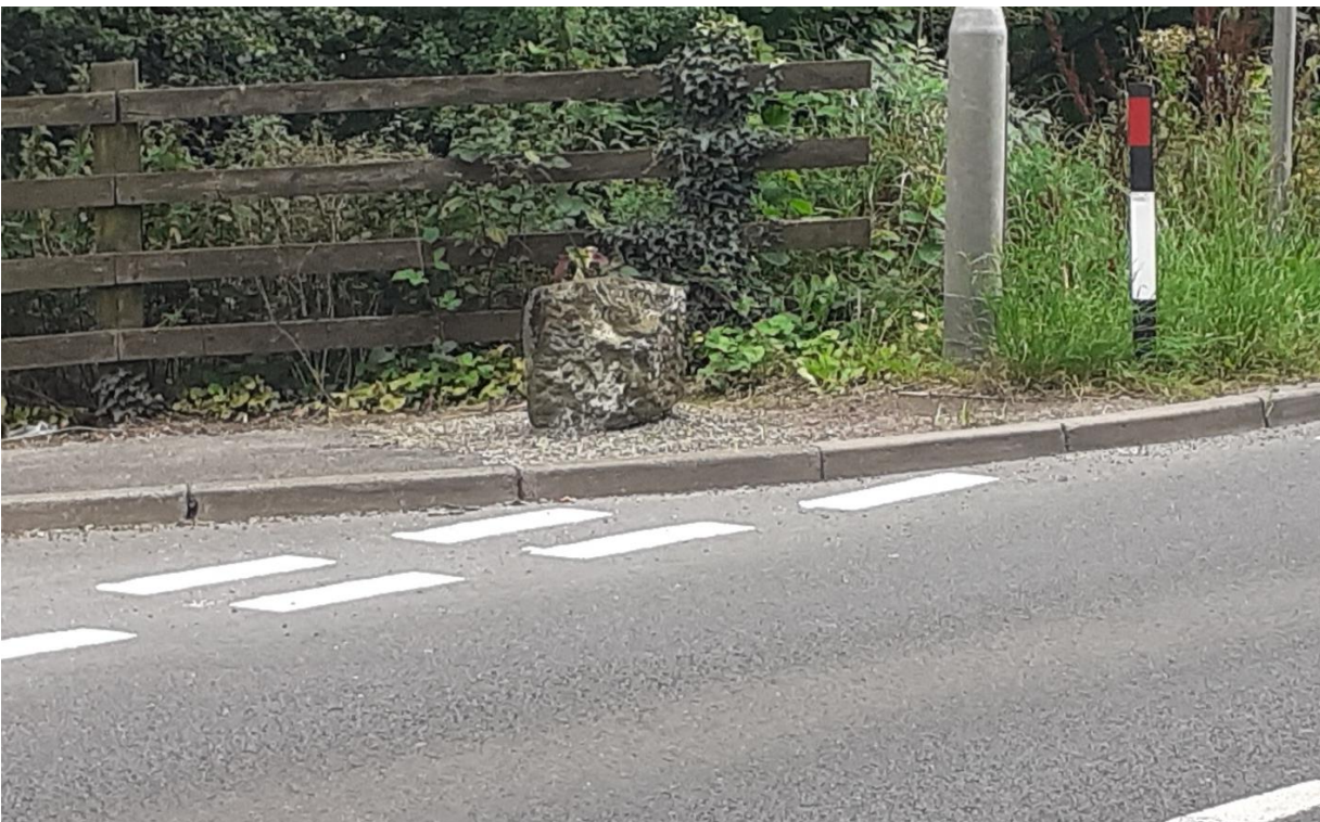
Plate 1: Milestone from north east