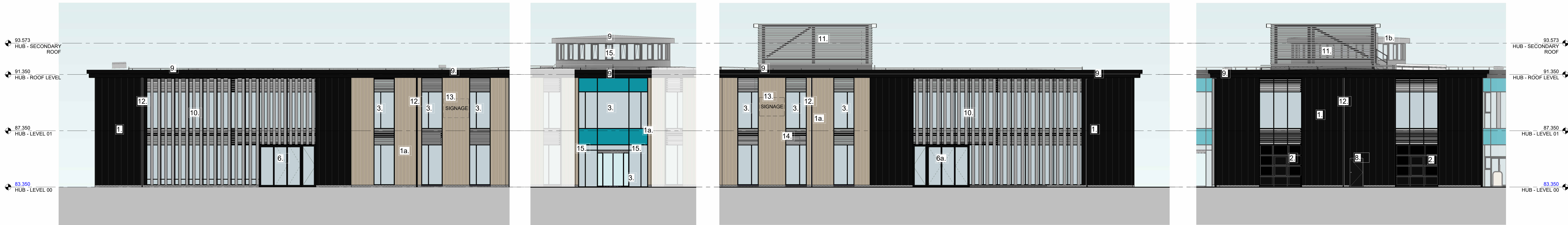
01 NORTH WING - WEST ELEVATION SCALE: 1 : 100