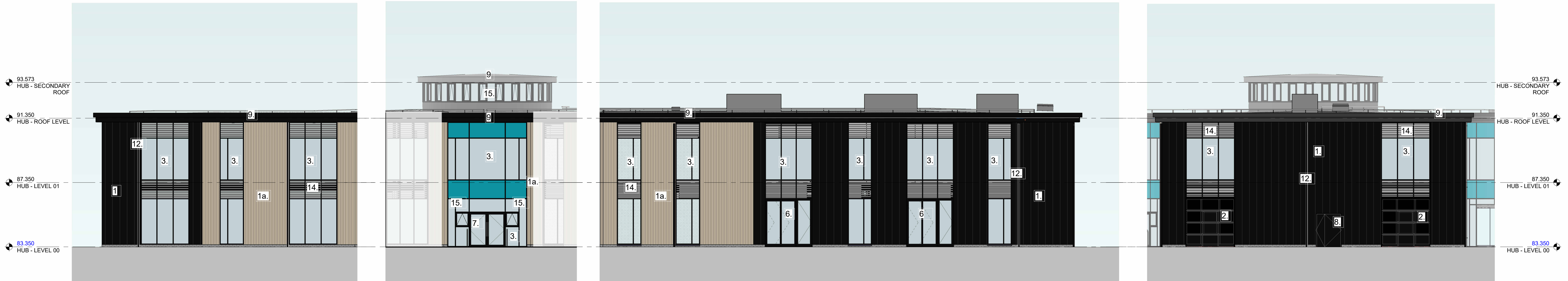
09 EAST WING - NORTH ELEVATION SCALE: 1 : 100