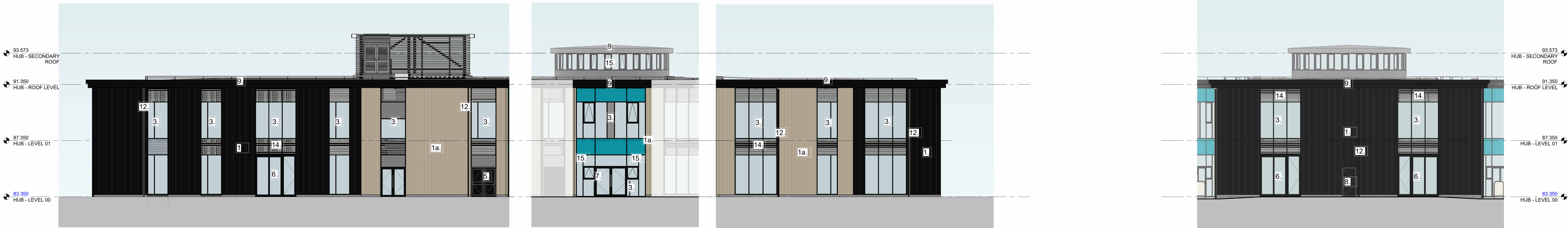
05 SOUTH WING - EAST ELEVATION SCALE: 1 : 100