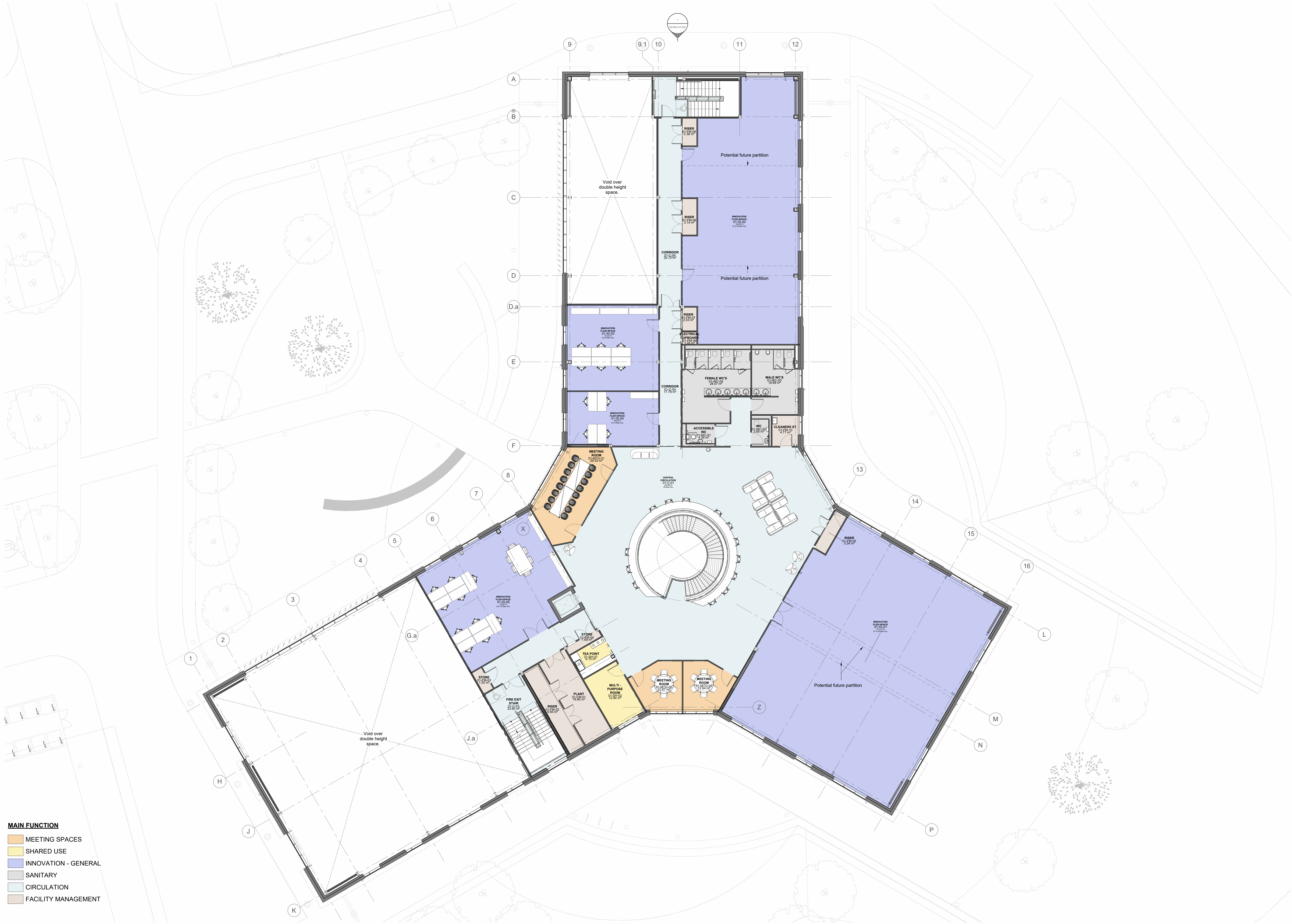
FIRST FLOOR - GA FLOOR PLAN SCALE: 1 : 100

FF&E is shown for coordination purposes only.