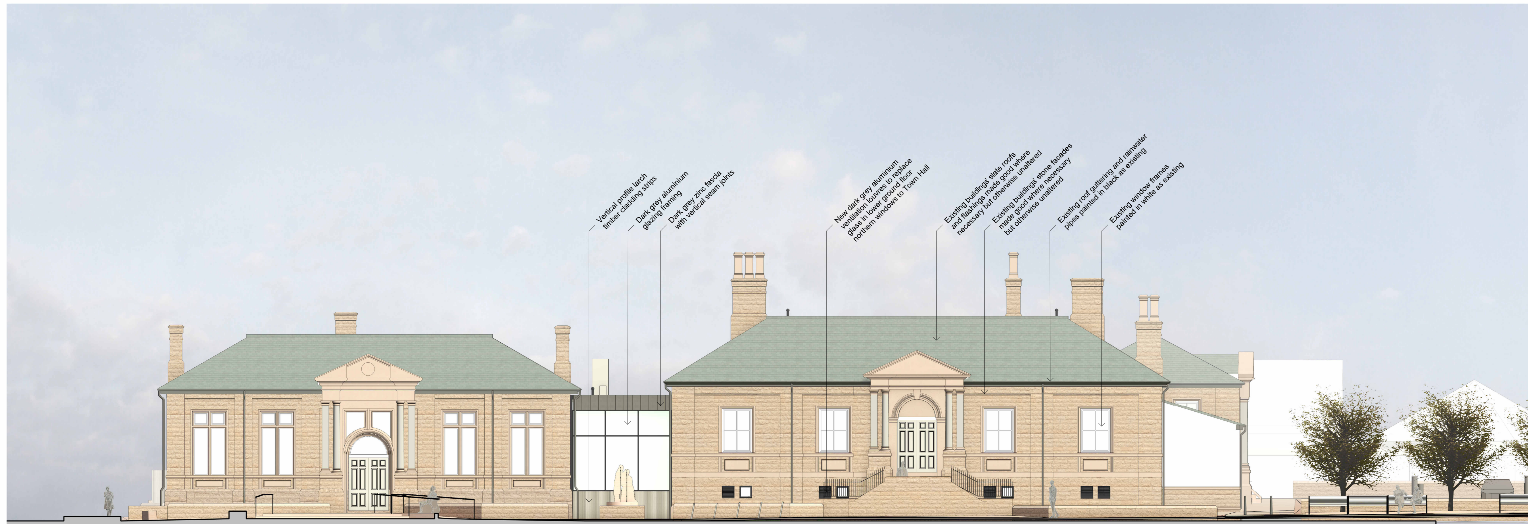
1 Community Hub - Proposed North Elevation 1 : 100