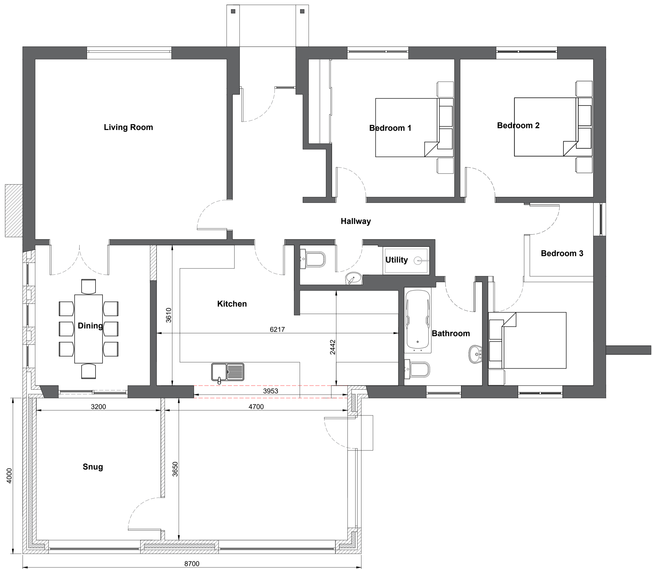
Proposed Ground Floor Plan 1/50