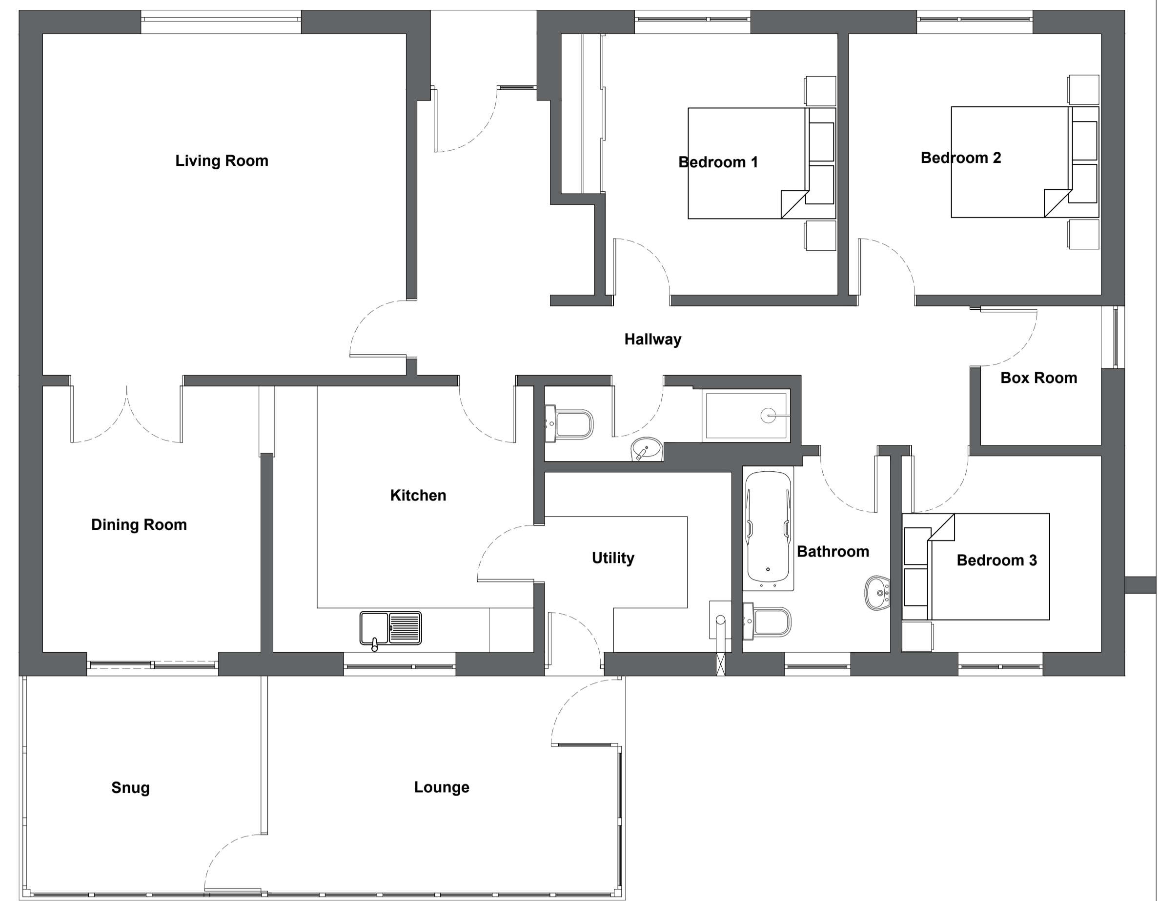
Existing Floor Plan 1/50