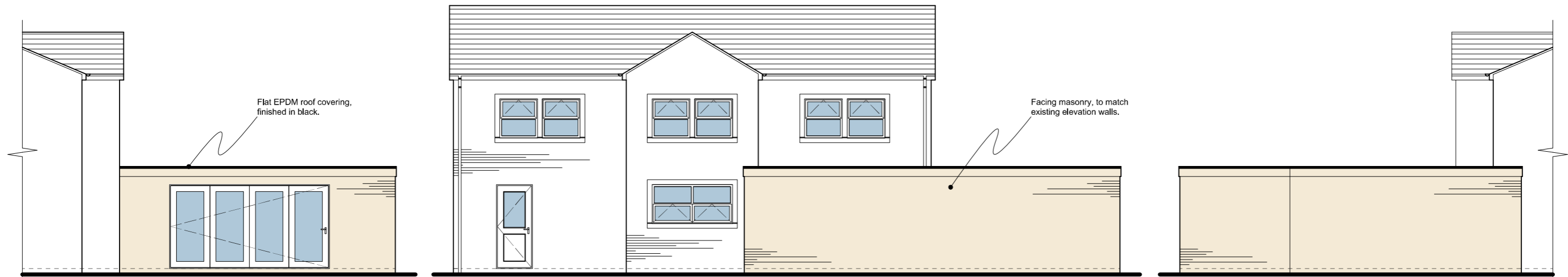
R/H GABLE ELEVATION (partial) SCALE 1:100 AS PROPOSED