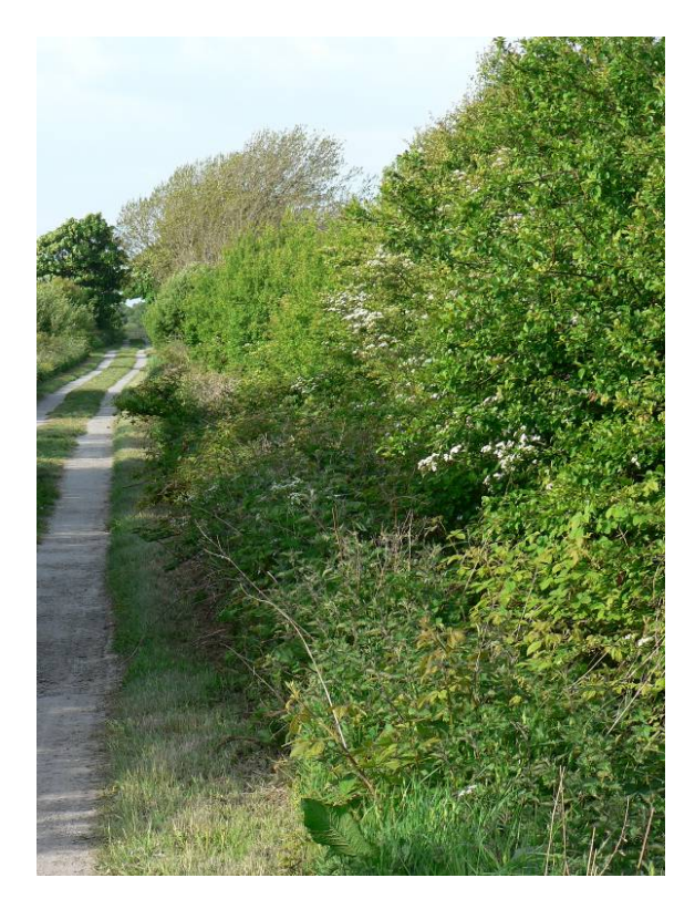
North Plain Farm, Bowness on Solway

Description Distribution and Extent Conservation Issues Planning Considerations Enhancement Opportunities Habitat Targets Key Species Further Information Contacts Current Action in Cumbria