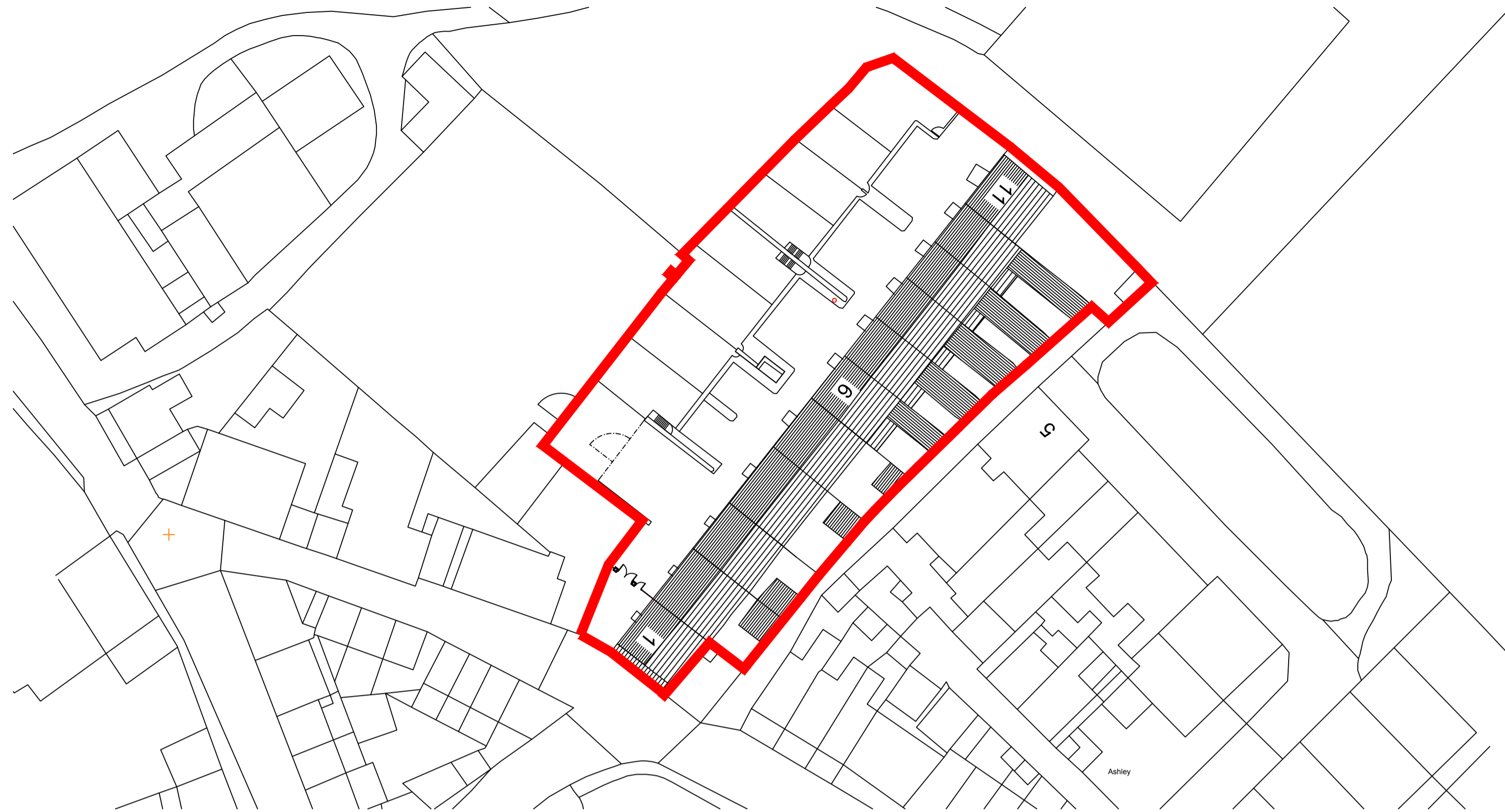
Block Plan as proposed Scale 1:500