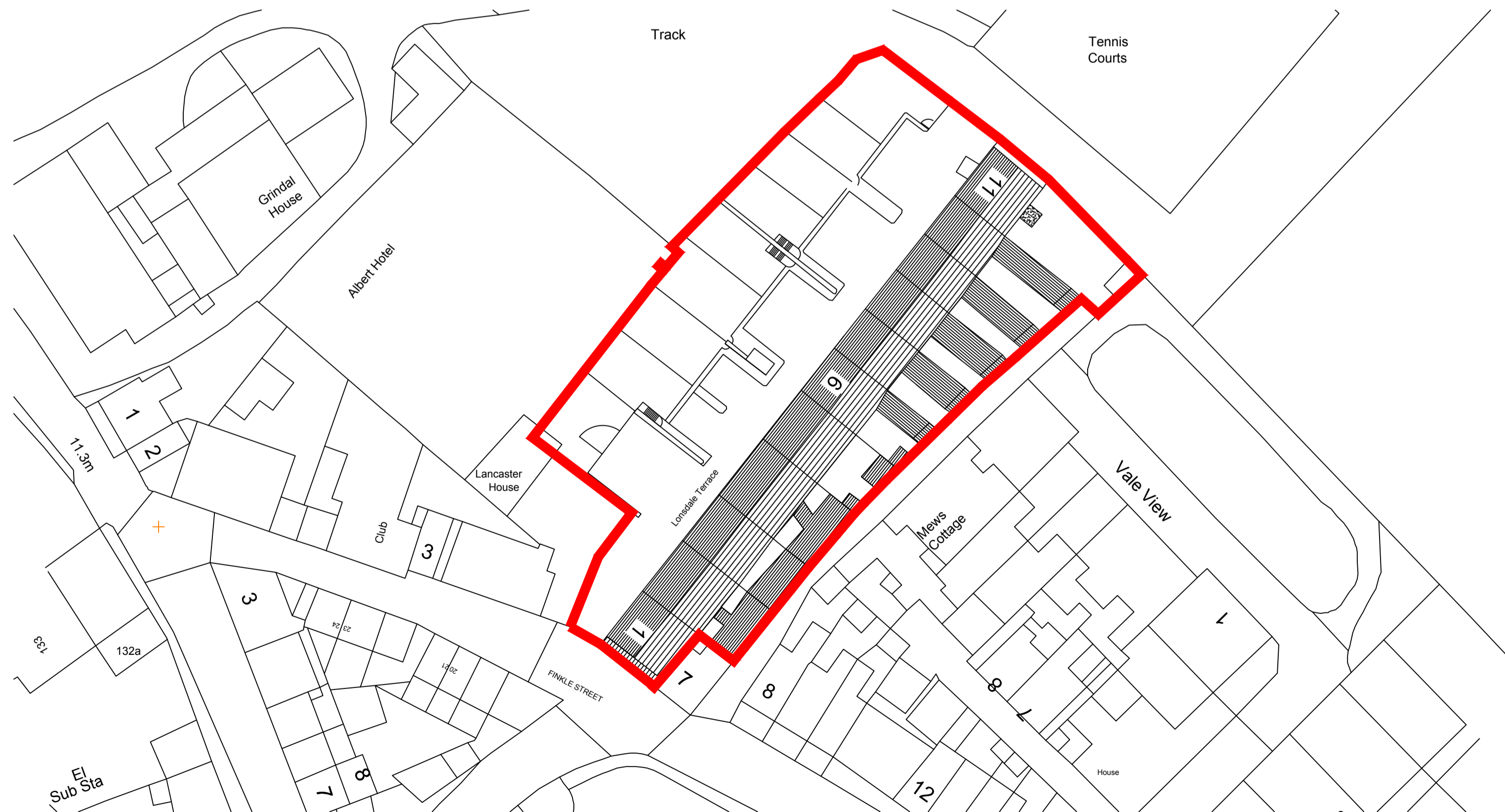
Block Plan as existing Scale 1:500