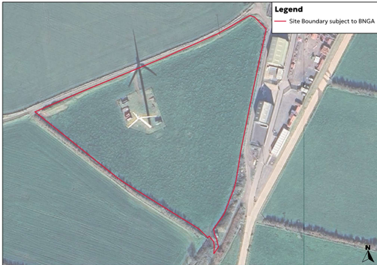
Figure 1: Site area subject to BNGA.