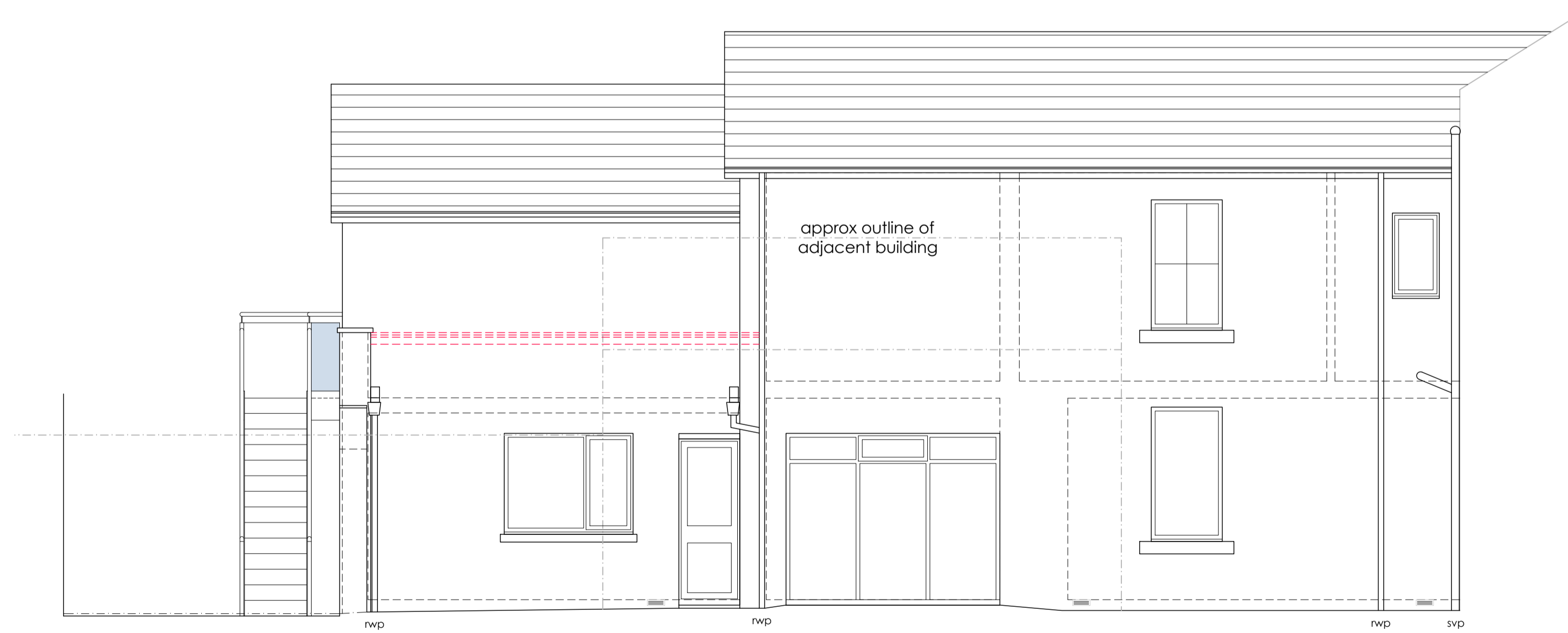
Rear (NNW) Elevation PROPOSED