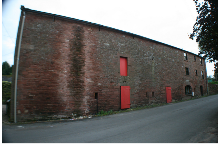
Barn & house from the west