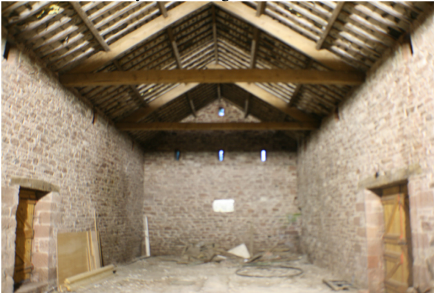
Interior of barn hayloft looking north