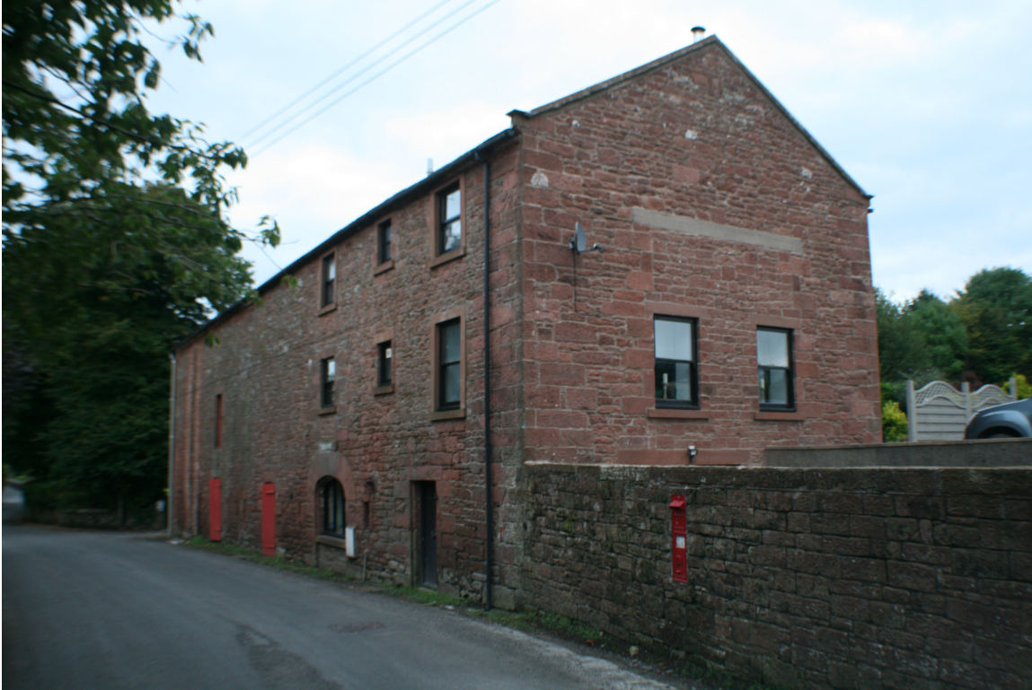
Barn and house viewed from the southwest