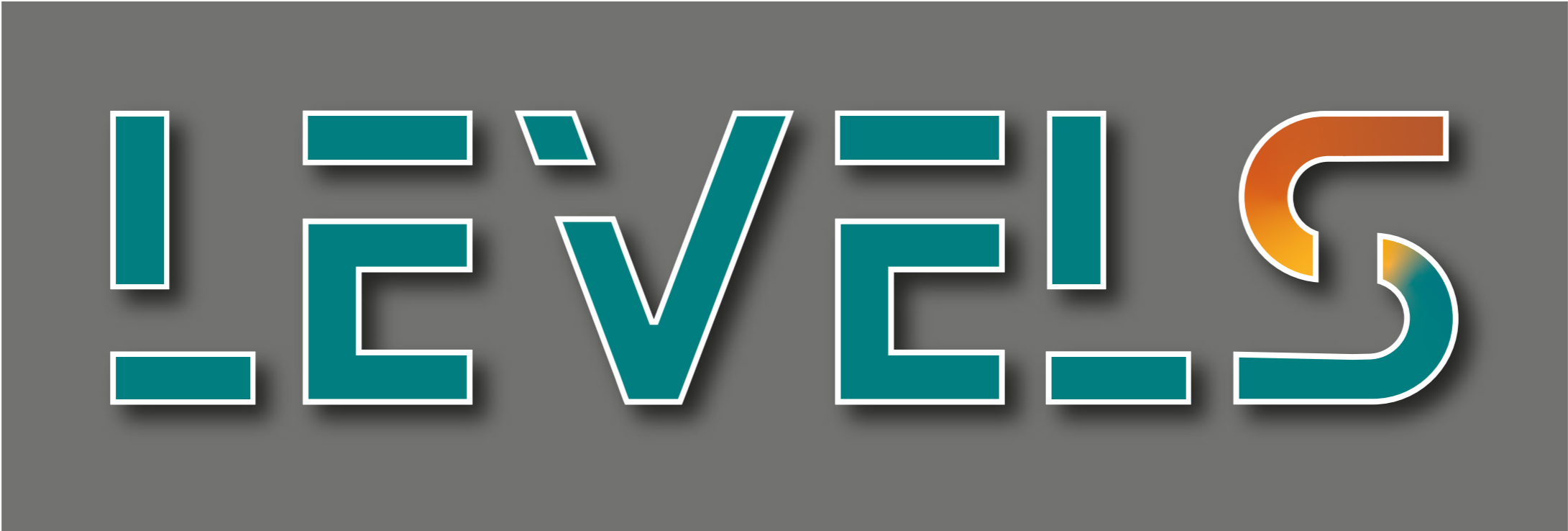
ITEM A 2350mm (w) x 512mm (h) Built up letters; illuminated edge