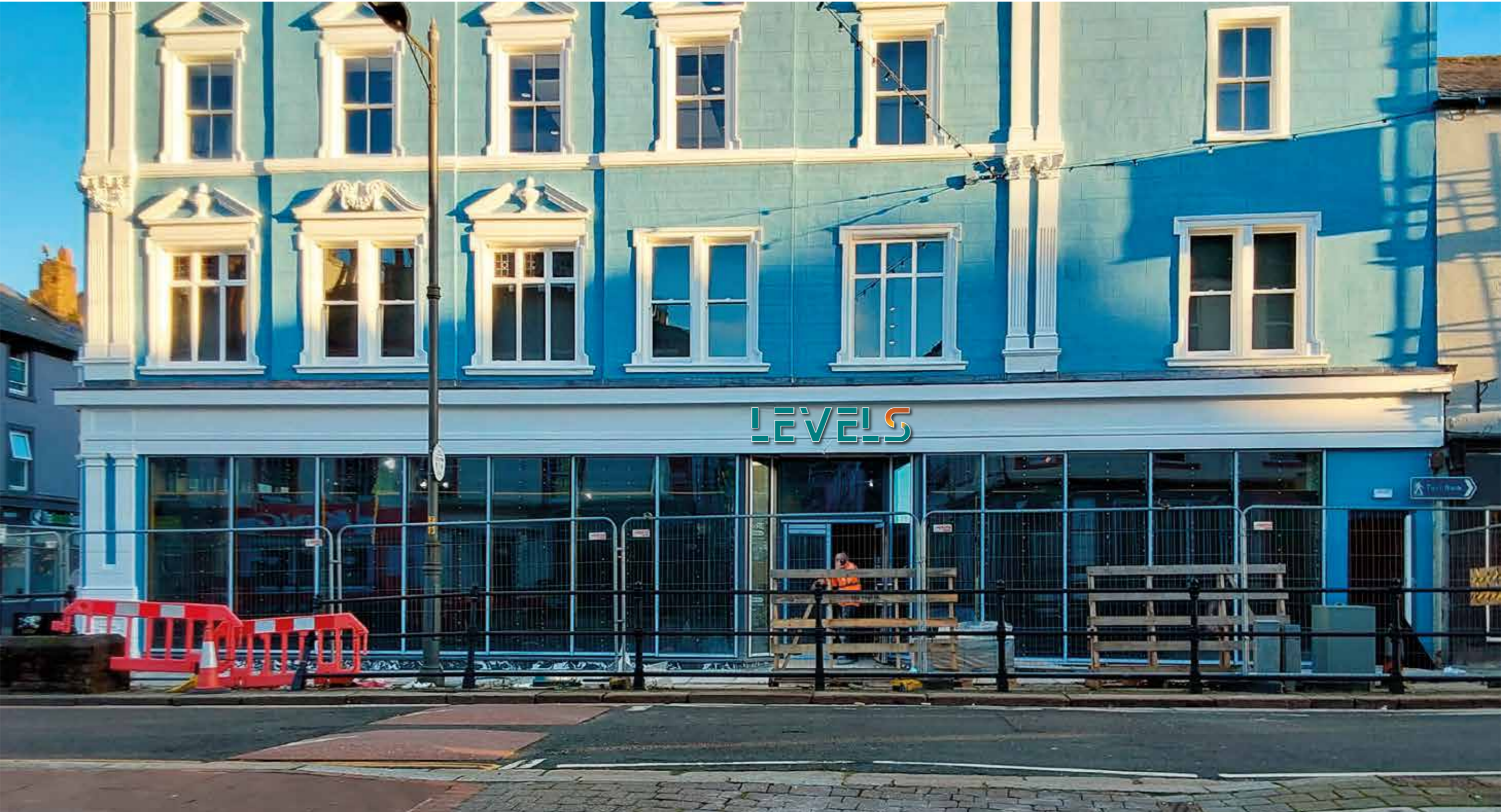
ITEM A 2350mm (w) x 512mm (h) Built up letters