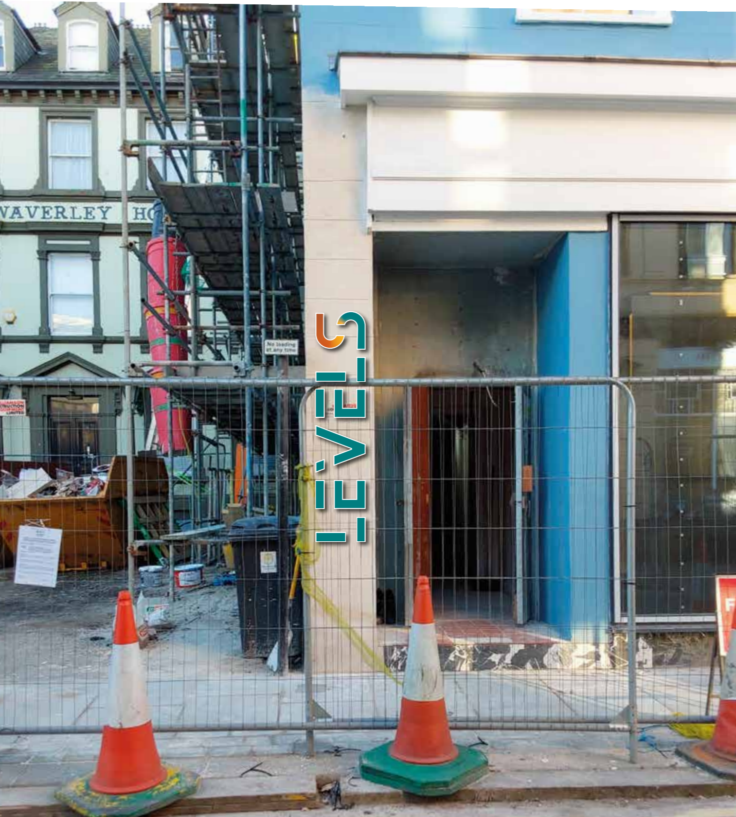
ITEM A 403mm (w) x 1850mm (h) Built up letters