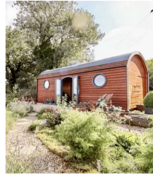
Indicative Image Pod