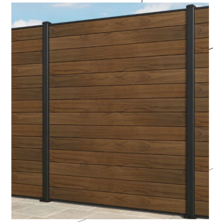
1.8m high low maintenance composite fencing installed to the perimeter of the pod terrace area.