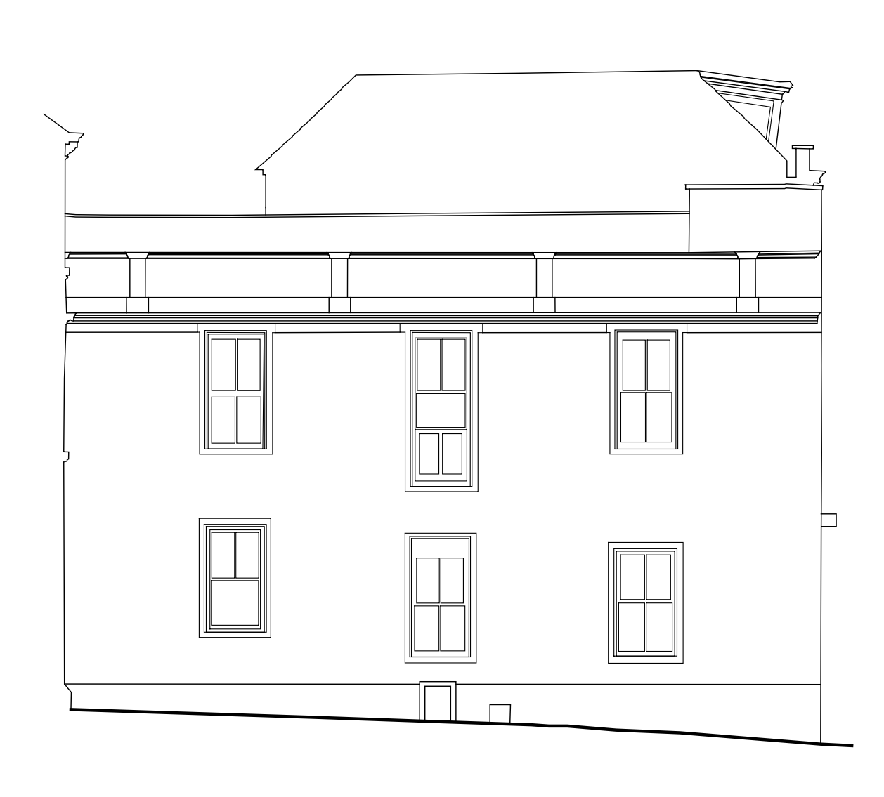
EXISTING ELEVATION - WAVERLEY HOTEL ELEVATION