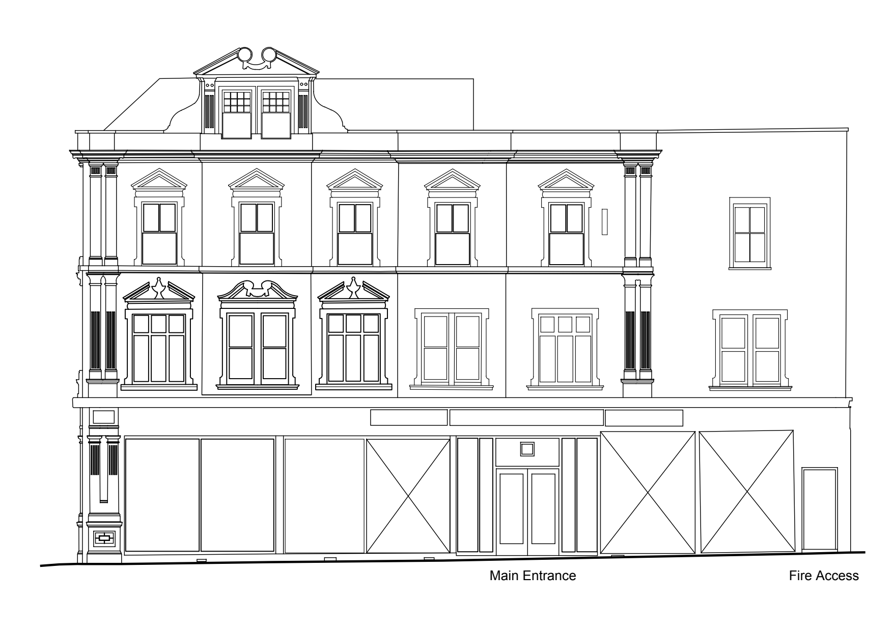
EXISTING ELEVATION - DUKE STREET scale 1:100

Application boundary:- 316sqm (3,401sqft)