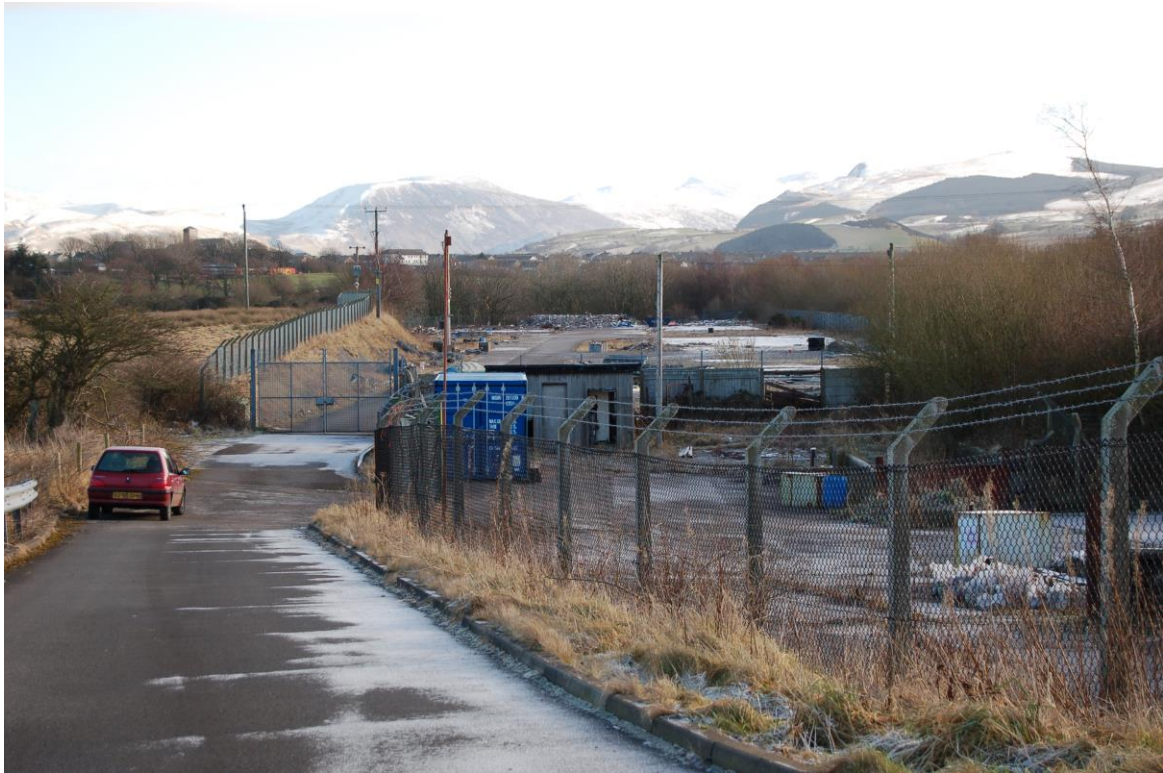
Plate 13 Station Yard, Moor Row, Cleator Moor, Cumbria General view of the site from the west taken from just to the north of the road bridge.