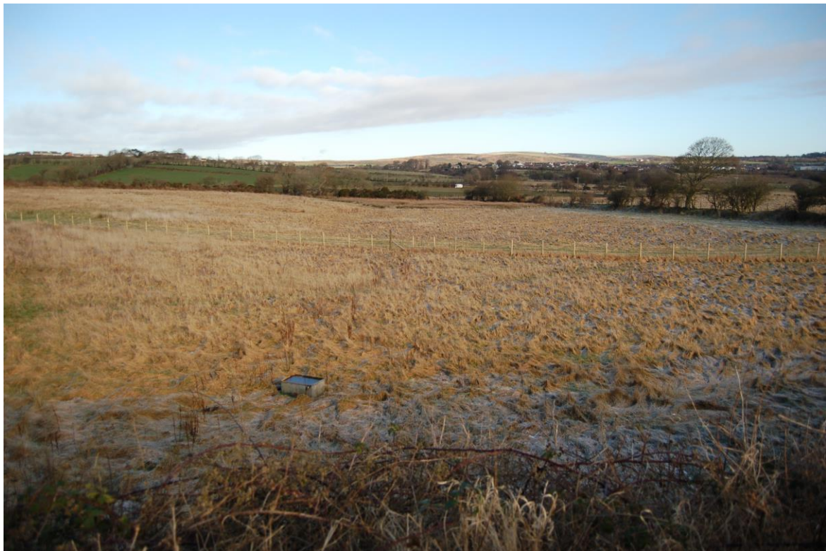
Plate 14 Station Yard, Moor Row, Cleator Moor, Cumbria The field (Area B on Figure 3), which will provide access to the site.