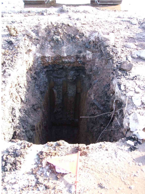
Plate 5 - TP643A – located at the eastern boundary of the Fatty Alcohol Plant