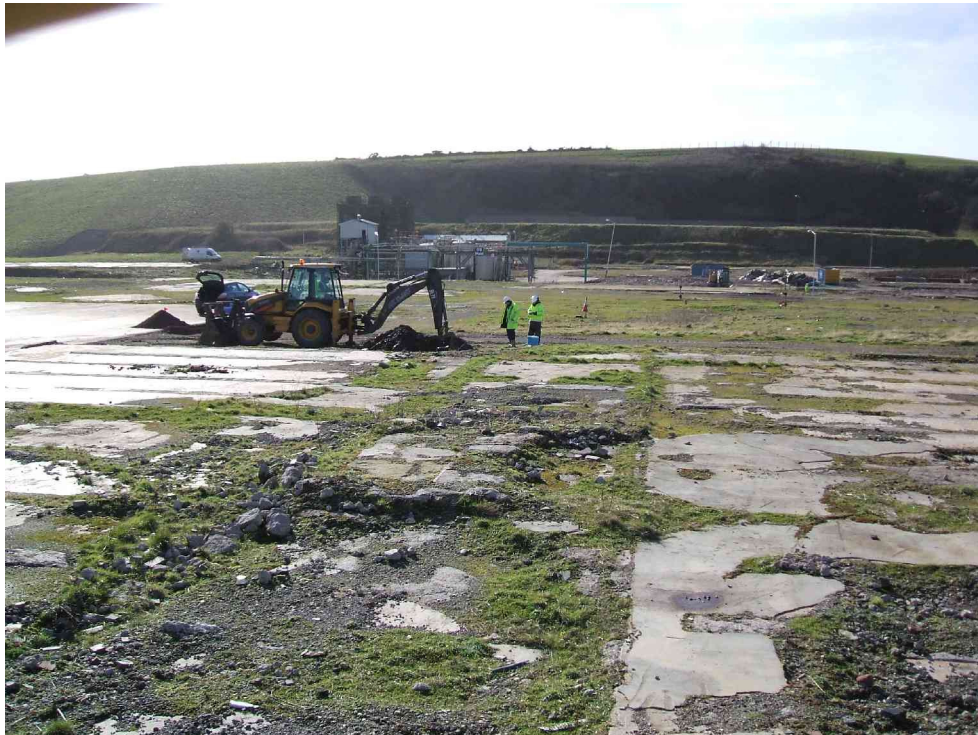
Plate 2 – In vicinity of TP635A; Excavator located in the vicinity of TP624A.