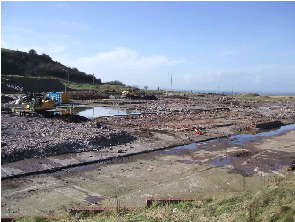
Plate 1 – Western boundary of Plot A in foreground (approximately 5m beyond pavement), in vicinity of TP641A; View over area of former Fatty Alcohol Plant towards northwest.