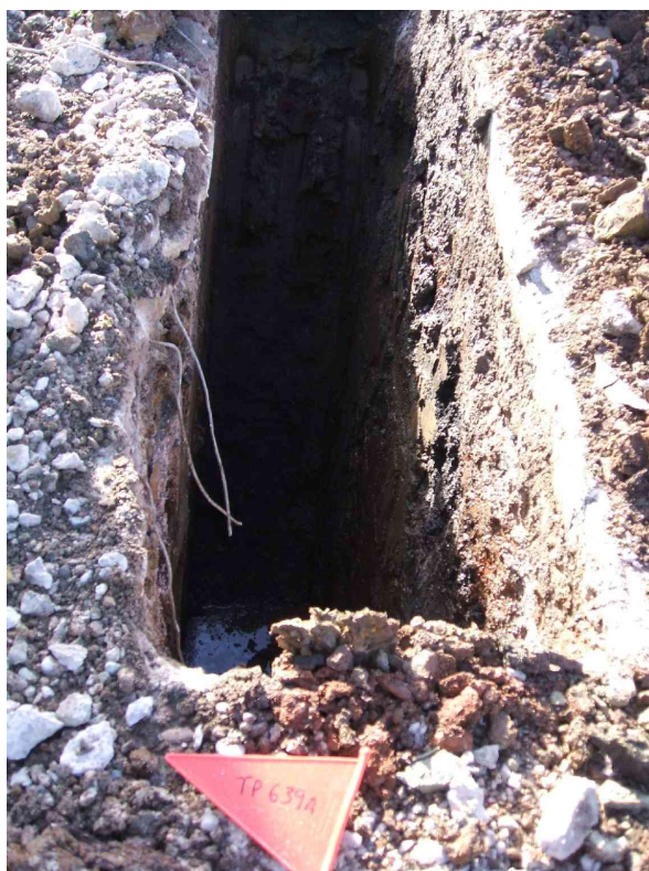
Plate 7 - TP639A. Orange-grey sandy clay as drift deposit and ingressed water at base of trial pit (excavation terminated at 3m bgl).