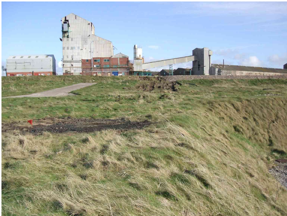
Plate 4 – View from within Plot A in vicinity of WS115; view towards northeast with S5 Building in the background