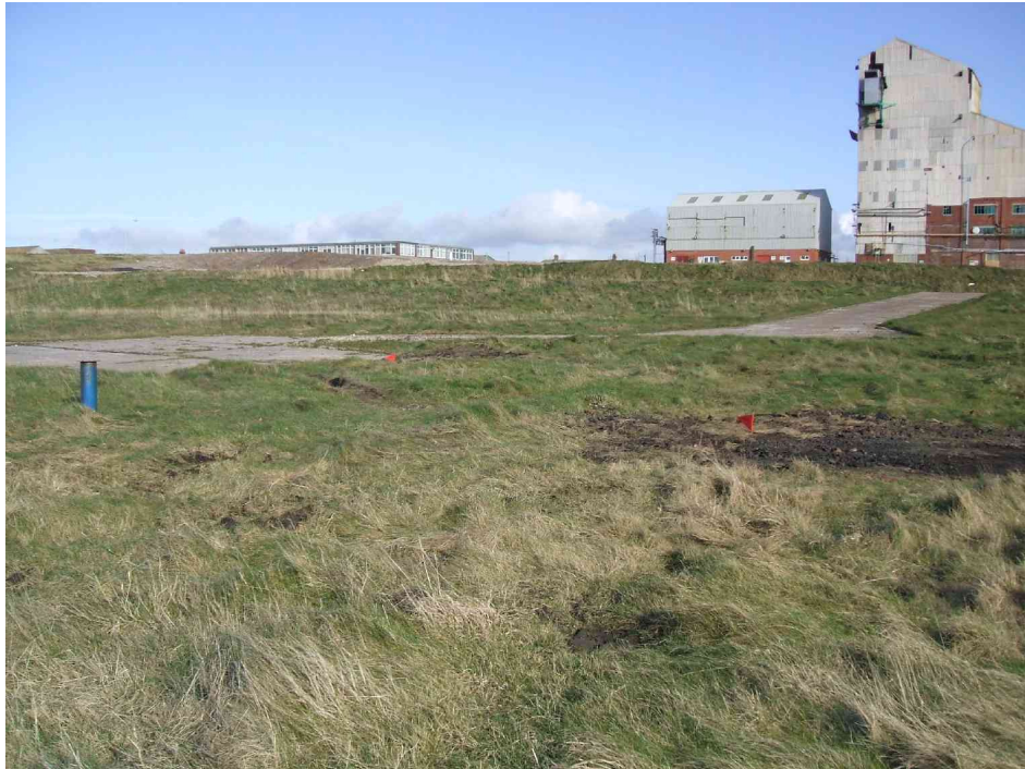
Plate 3 – View from within Plot A in vicinity of WS115; view towards northeast with S5 Building in the background (right side).