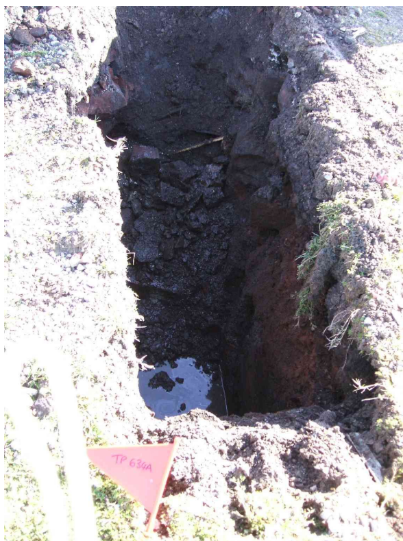
Plate 8 - TP634A – located at the southeastern border of Plot A within former Dry and Wet Salts Area. About 0.2m of ingressed water (excavation terminated at 1.85m bgl).