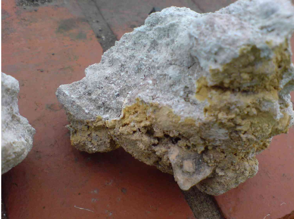
Plate 10 – Cement clinker found in several locations within Plots A and D.