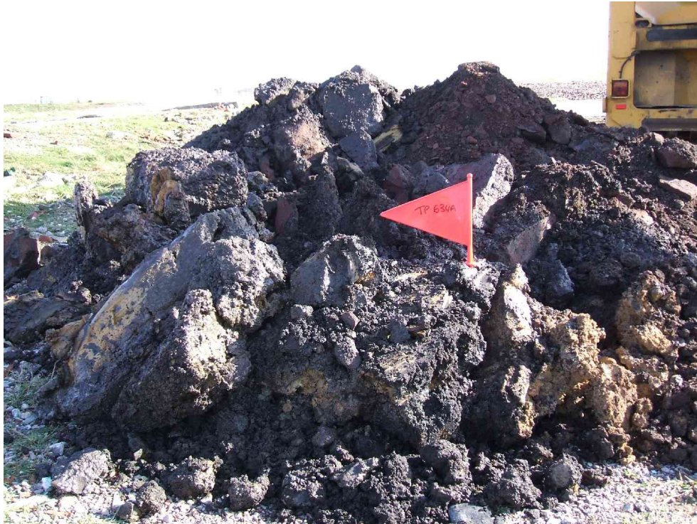
Plate 9 – Spoil of TP634A. Silt with abundant gravel (0.35 to 1m bgl) overlying yellow brown silty clay.