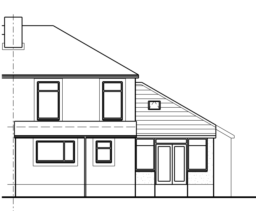
proposed rear elevation