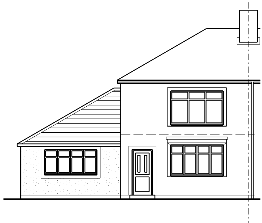
proposed front elevation