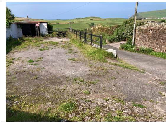
View of the original public house car parking area looking West. Defective hardstanding and deteriorating timber post and rail fencing to the Northern boundary separating the site from the lonning.