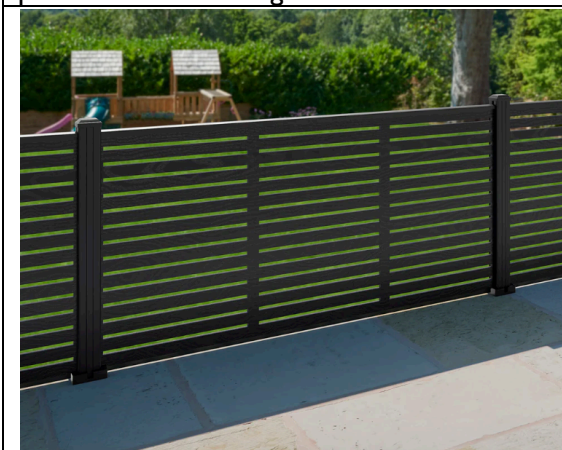
Example of proposed screening to the seating and terraced areas.