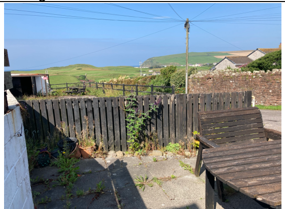
Image of the picket style painted timber fencing partially enclosing the former public house rear terrace.