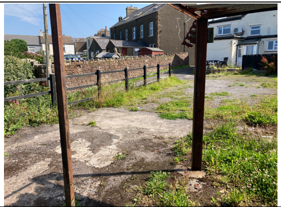
View of the original public house car parking area looking East back toward the main building. Defective hardstanding and deteriorating timber post and rail boundary fencing.