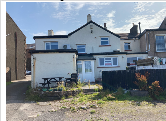
General view of the West facing rear elevation of the former public house, raised terrace area partially enclosed by picket style painted timber fencing.