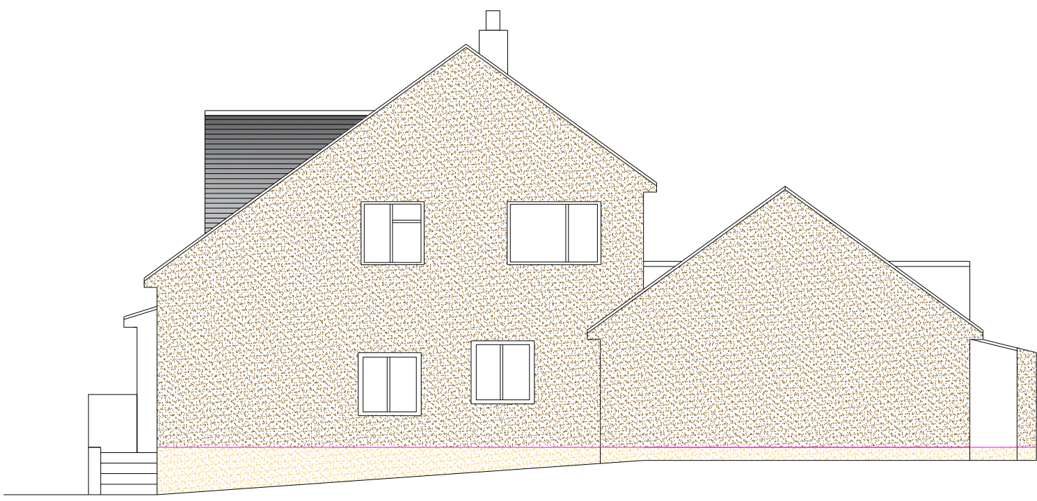
Existing North East Elevation Scale 1-100