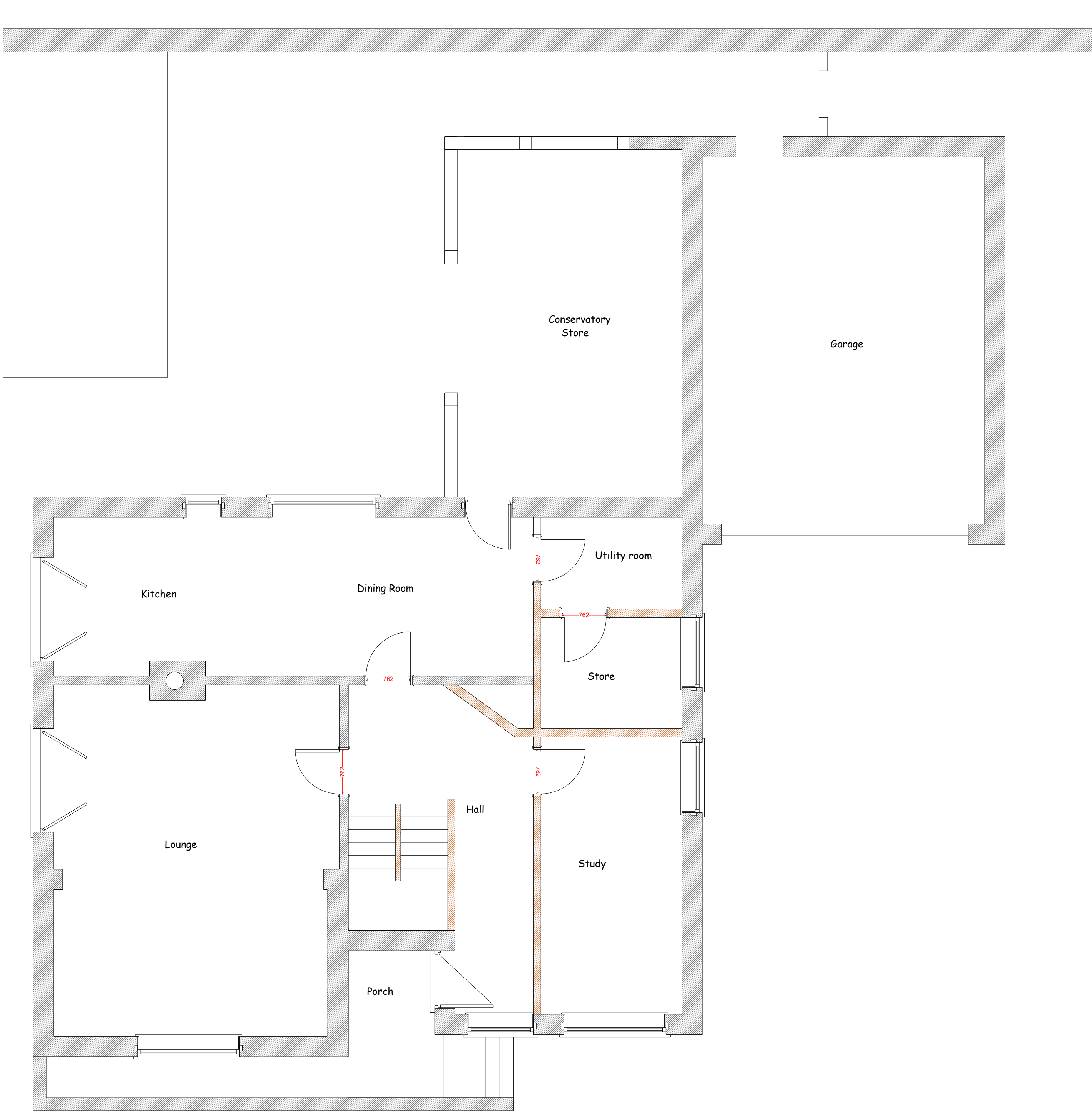
Existing Ground Floor Scale 1-50