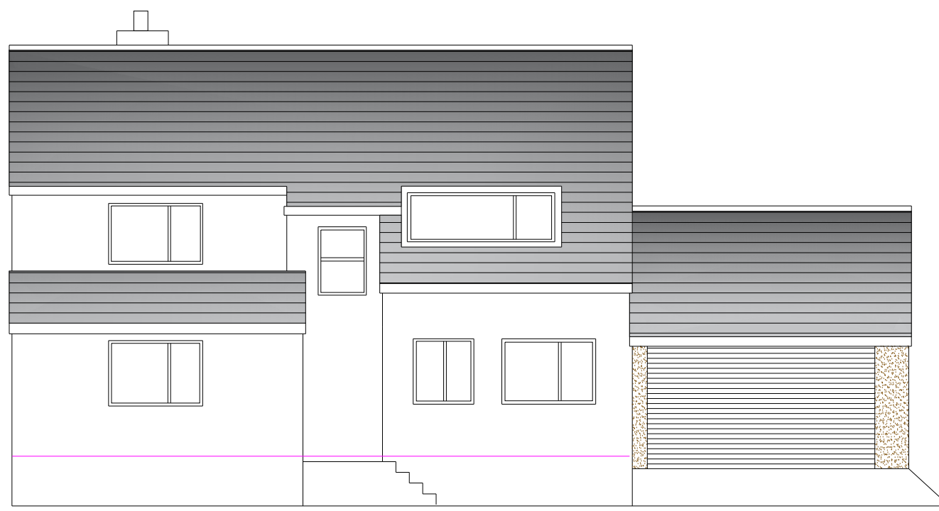
Existing South West Elevation Scale 1-100