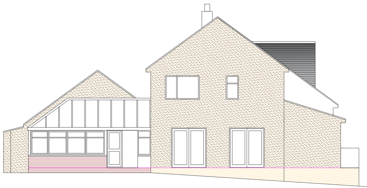
Existing South West Elevation Scale 1-100