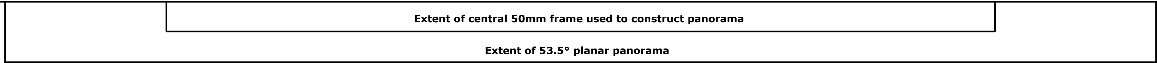
This image provides landscape and visual context only