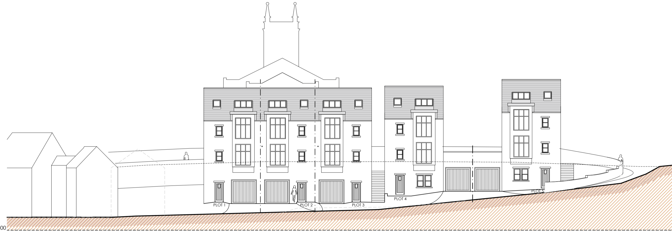
Site Section B-B: East (Rear) Elevation As Proposed 1:200 @ A1