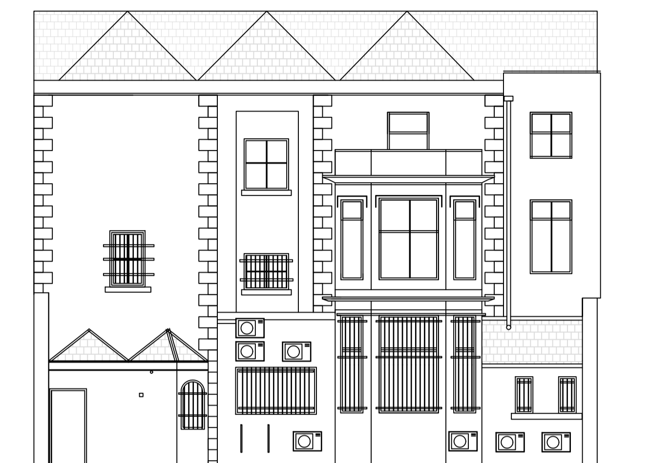
EXISTING & PROPOSED REAR ELEVATION