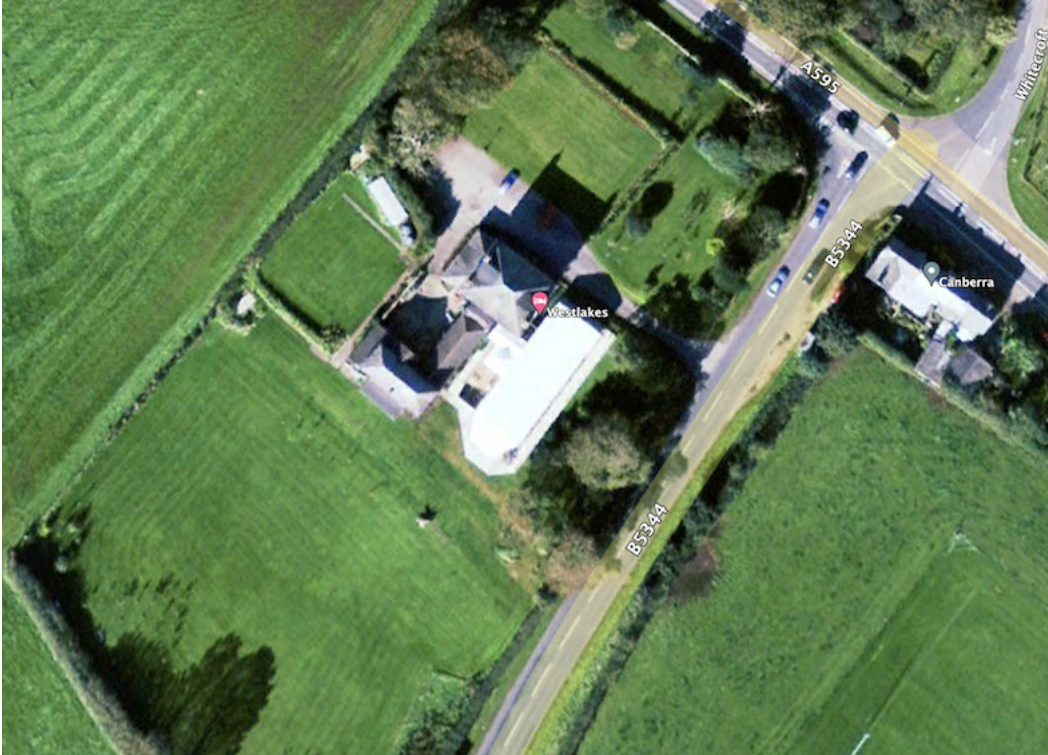
Google Earth image October 2008