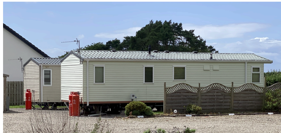
Static caravans in situ