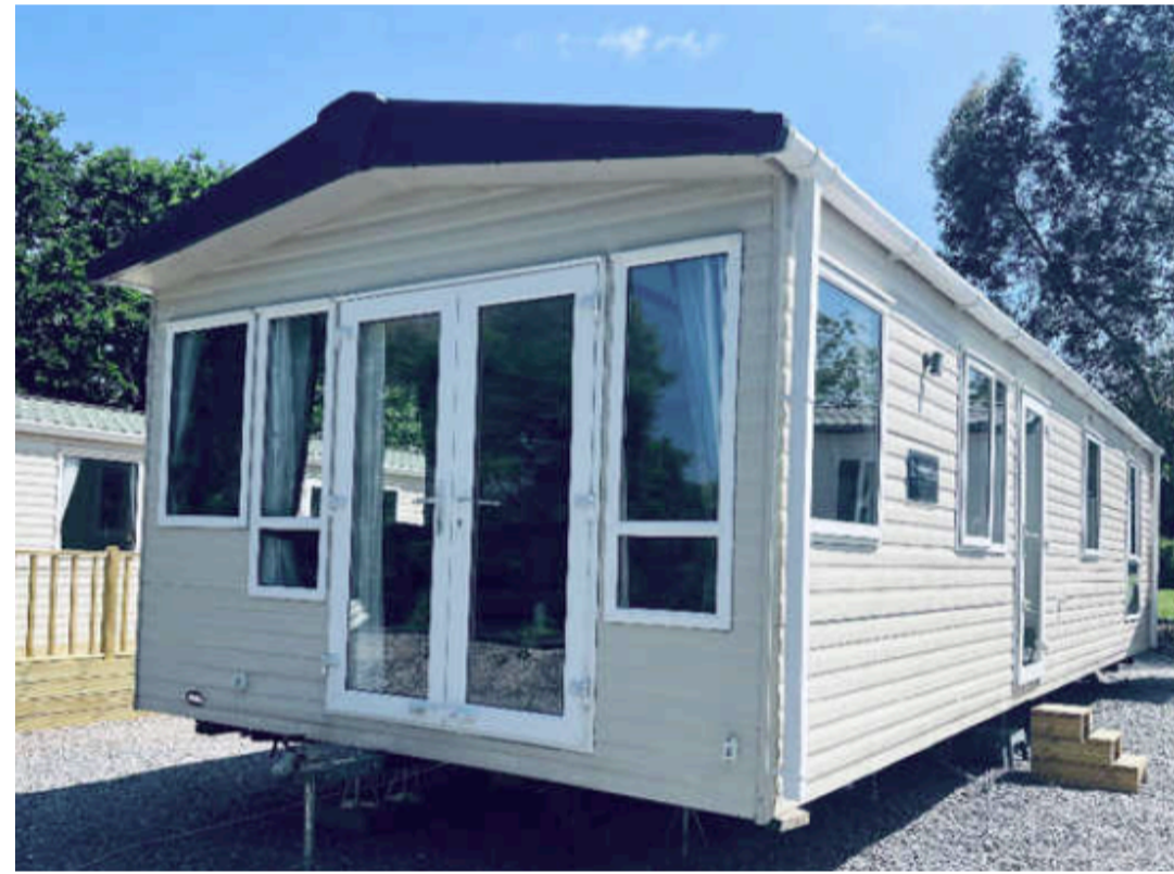
ABI Sunningdale 12x35ft static caravan example image Dimensions 3.6m wideX10.6m lengthX3m height Gable end windows and doors to face north-east