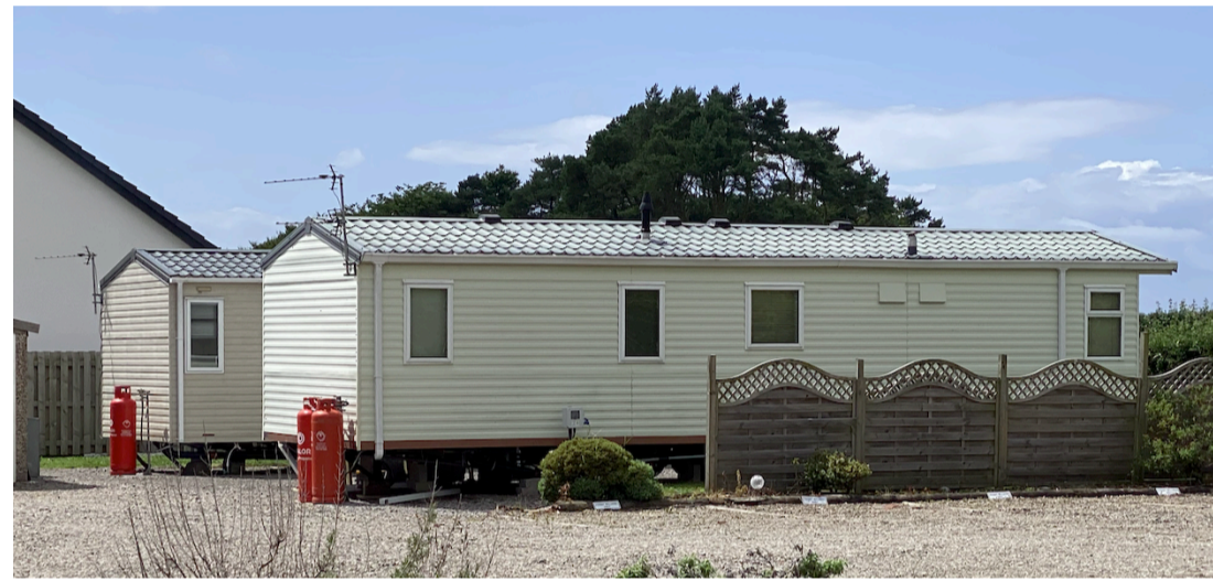
Static caravans in situ