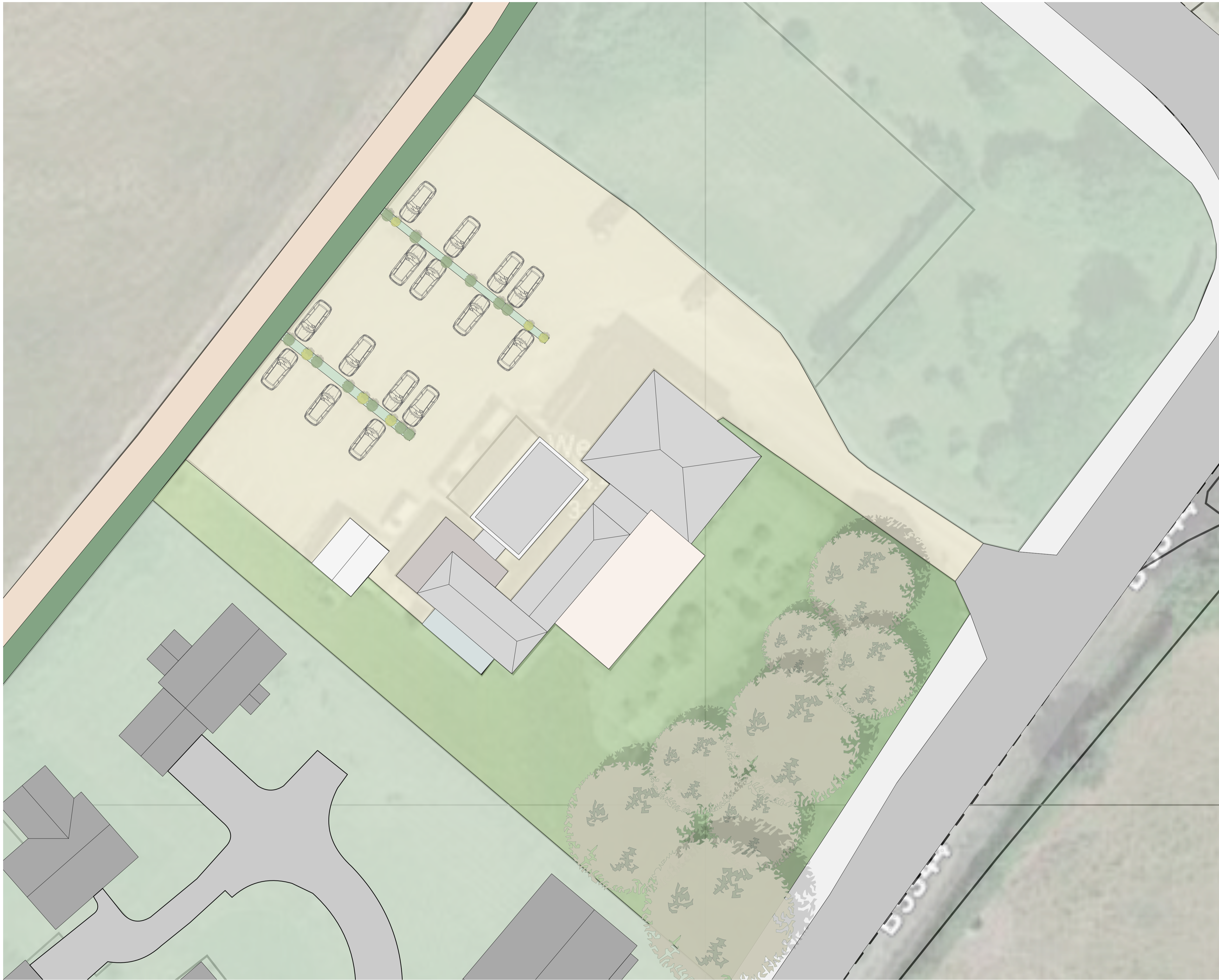
1 Existing Site Plan Scale: - 1:200