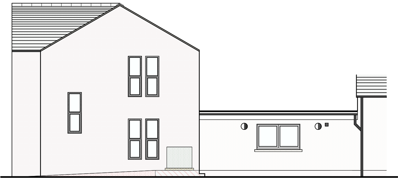
Proposed East Elevation - Scale 1:100