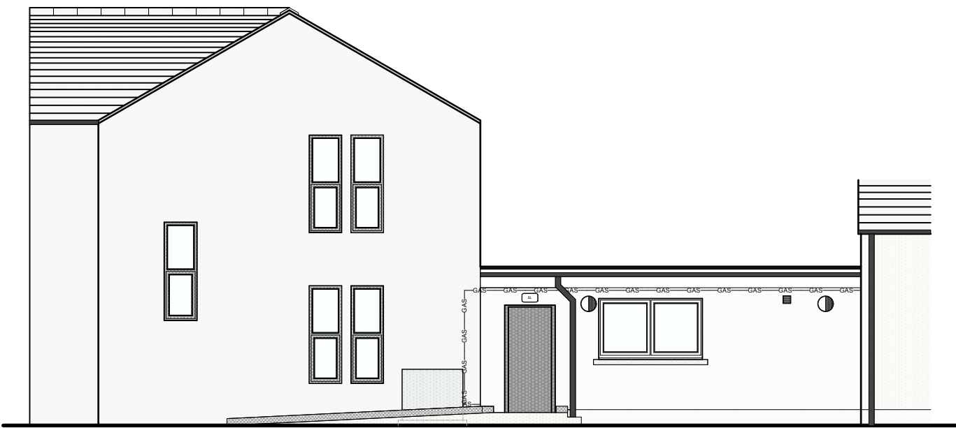
Existing East Elevation - Scale 1:100