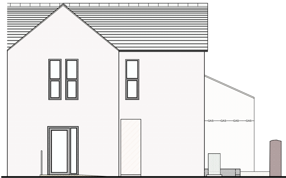
Existing South Elevation - Scale 1:100