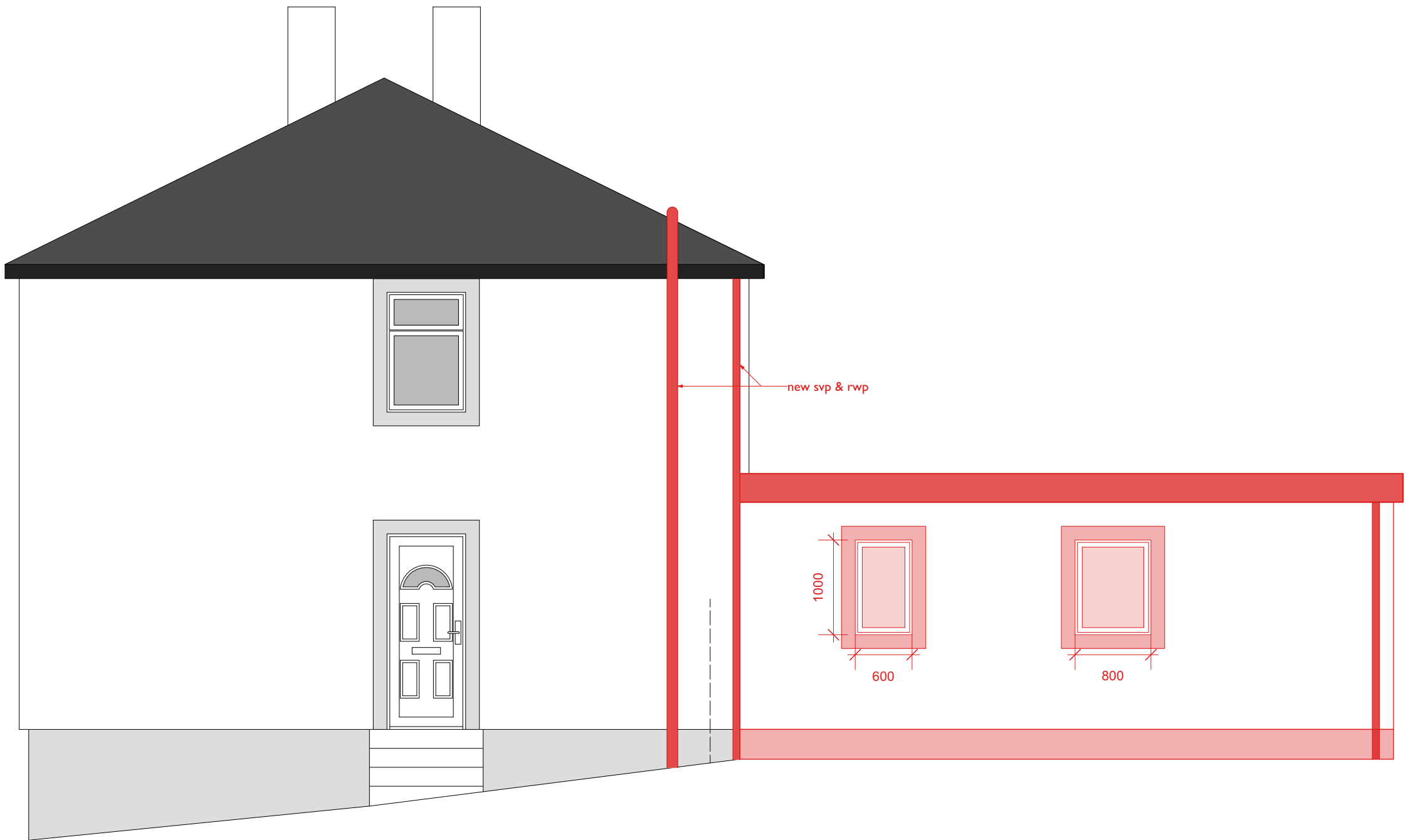
South Elevation Scale 1:50

NOTE: All dimensions to be checked on site. All dimensions in millimetres unless stated otherwise.