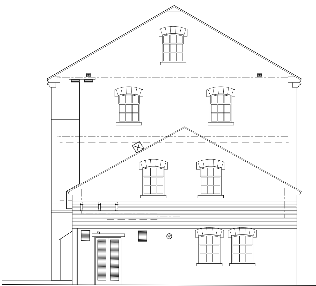
EXISTING SOUTH EAST ELEVATION (CRAGG ROAD)