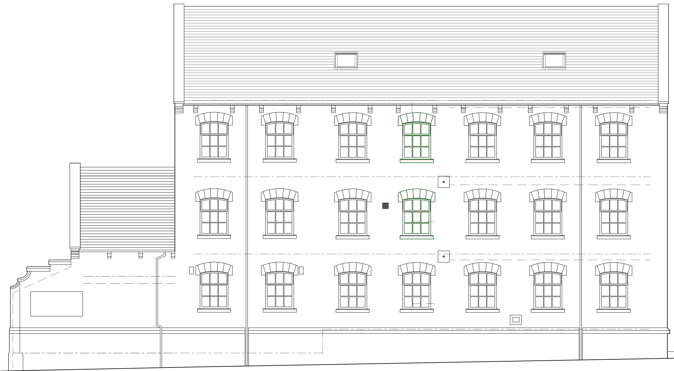
EXISTING NORTH EAST ELEVATION (CRAGG ROAD)