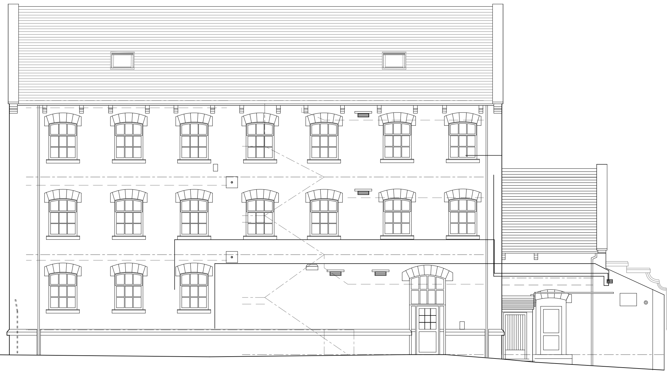
EXISTING SOUTH WEST ELEVATION (EARL STREET)