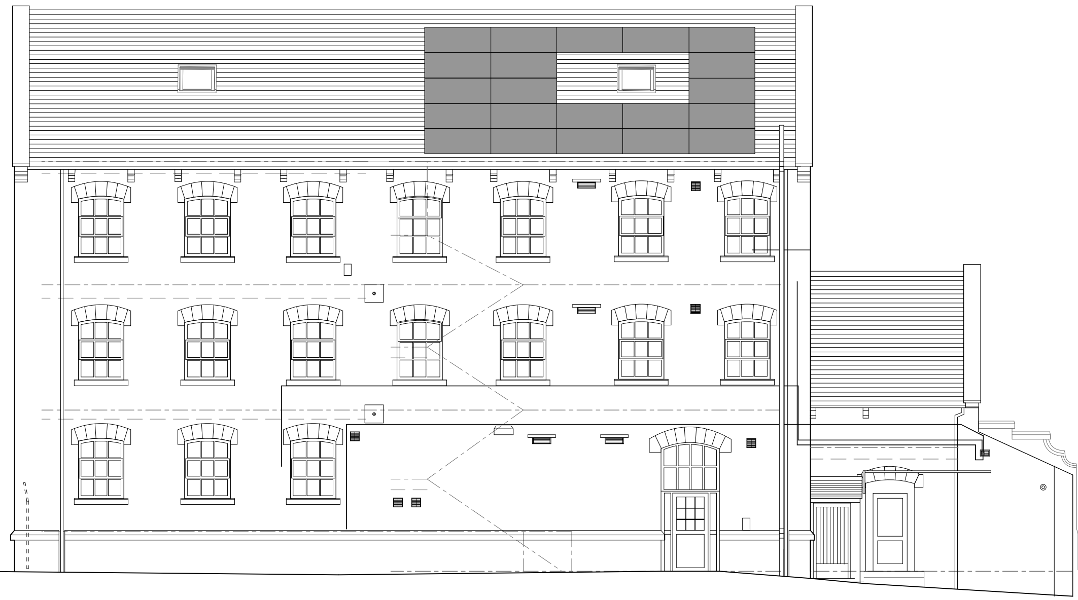
PROPOSED SOUTH WEST ELEVATION (EARL STREET)