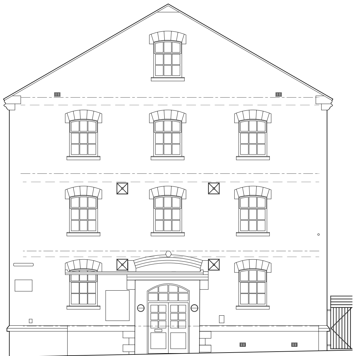
EXISTING NORTH WEST ELEVATION (EARL STREET)