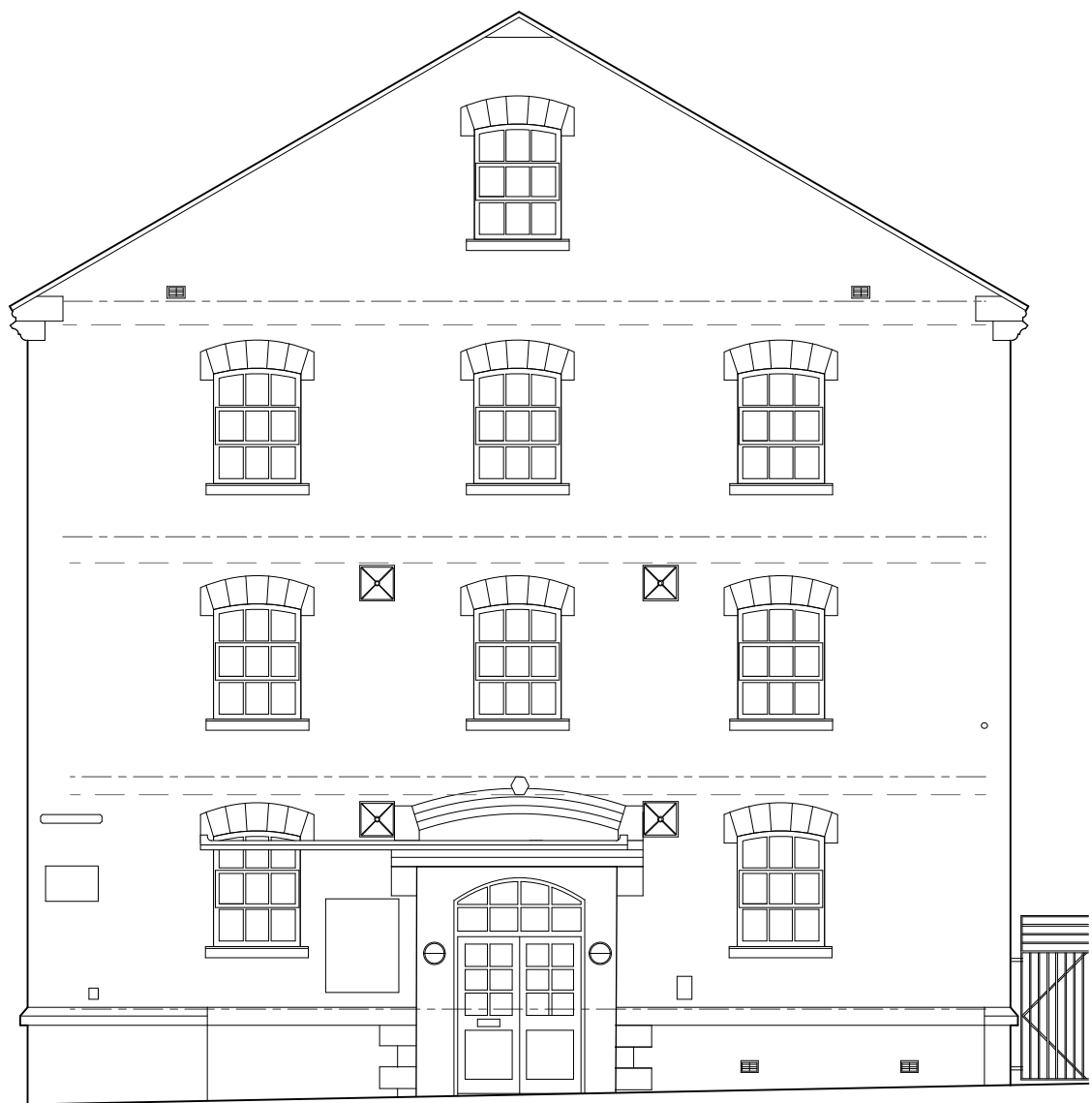
PROPOSED NORTH WEST ELEVATION (EARL STREET)