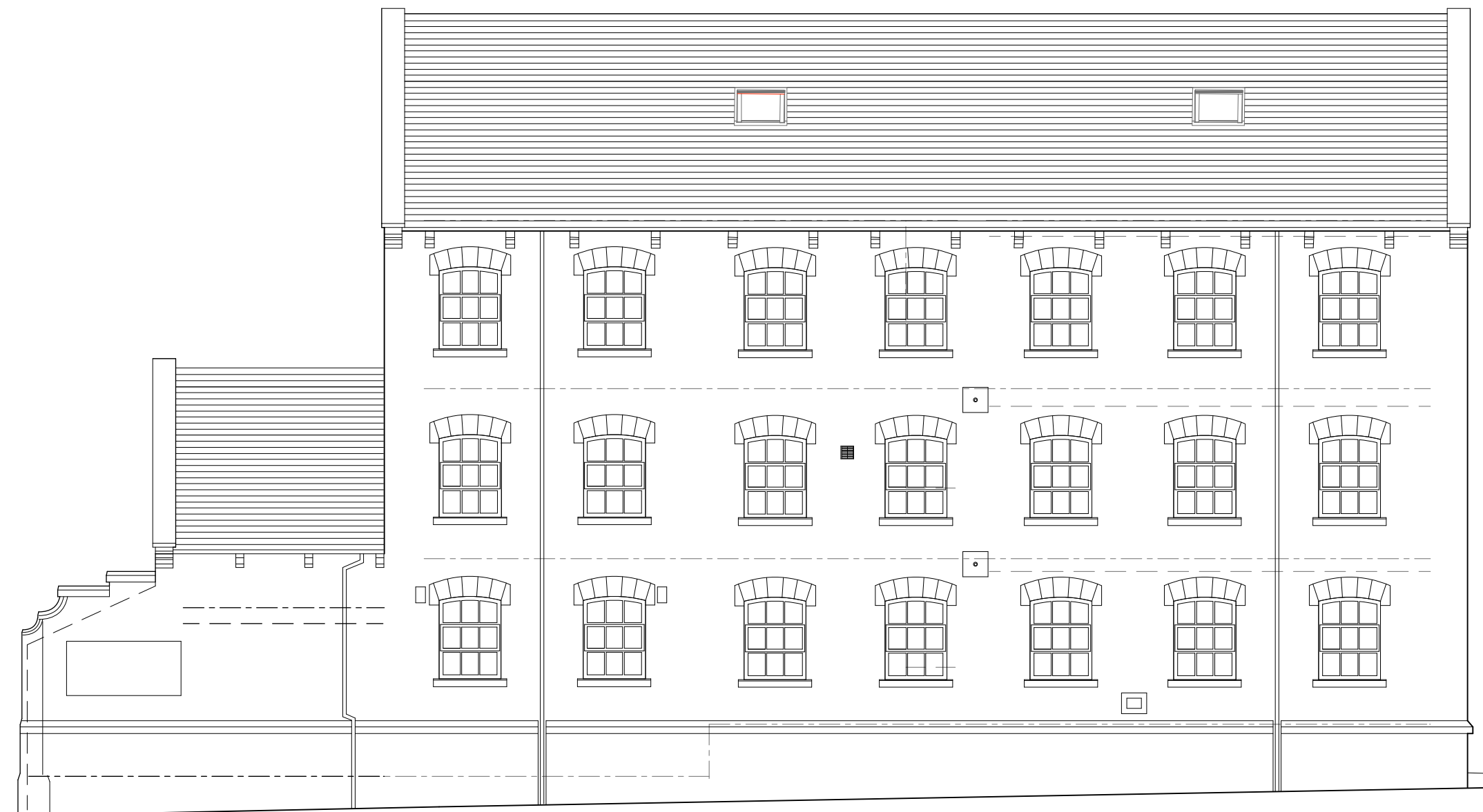
PROPOSED NORTH EAST ELEVATION (CRAGG ROAD)