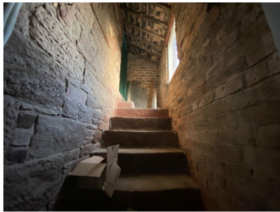
Images 5&6: Link extension enclosing historic rear stairs & internal view of stairs

The aerial photo (ref image 1) shows that a link was present in the 1970's and this was further enlarged, as evident in more recent photos/the current layout (ref images 3 & 4). Despite these changes over time, it is recognised that the building has historic architectural value, with traditional features/character that should be preserved.