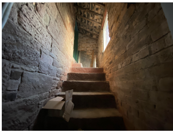
Images 5&6: Link extension enclosing historic rear stairs & internal view of stairs

The aerial photo (ref image 1) shows that a link was present in the 1970's and this was further enlarged, as evident in more recent photos/the current layout (ref images 3 & 4). Despite these changes over time, it is recognised that the building has historic architectural value, with traditional features/character that should be preserved.