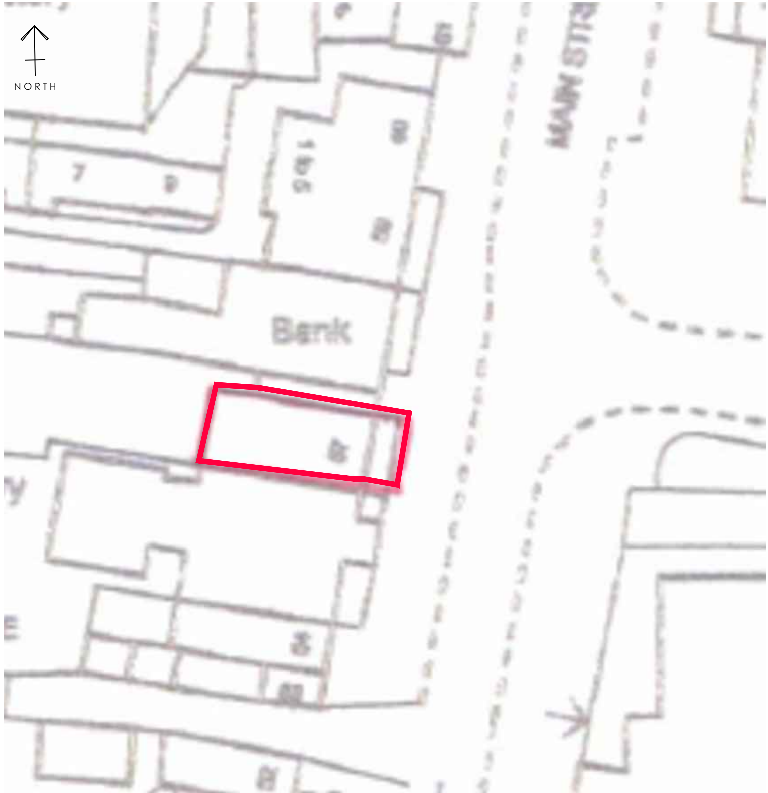
LOCATION PLAN 1:1250 @ A3