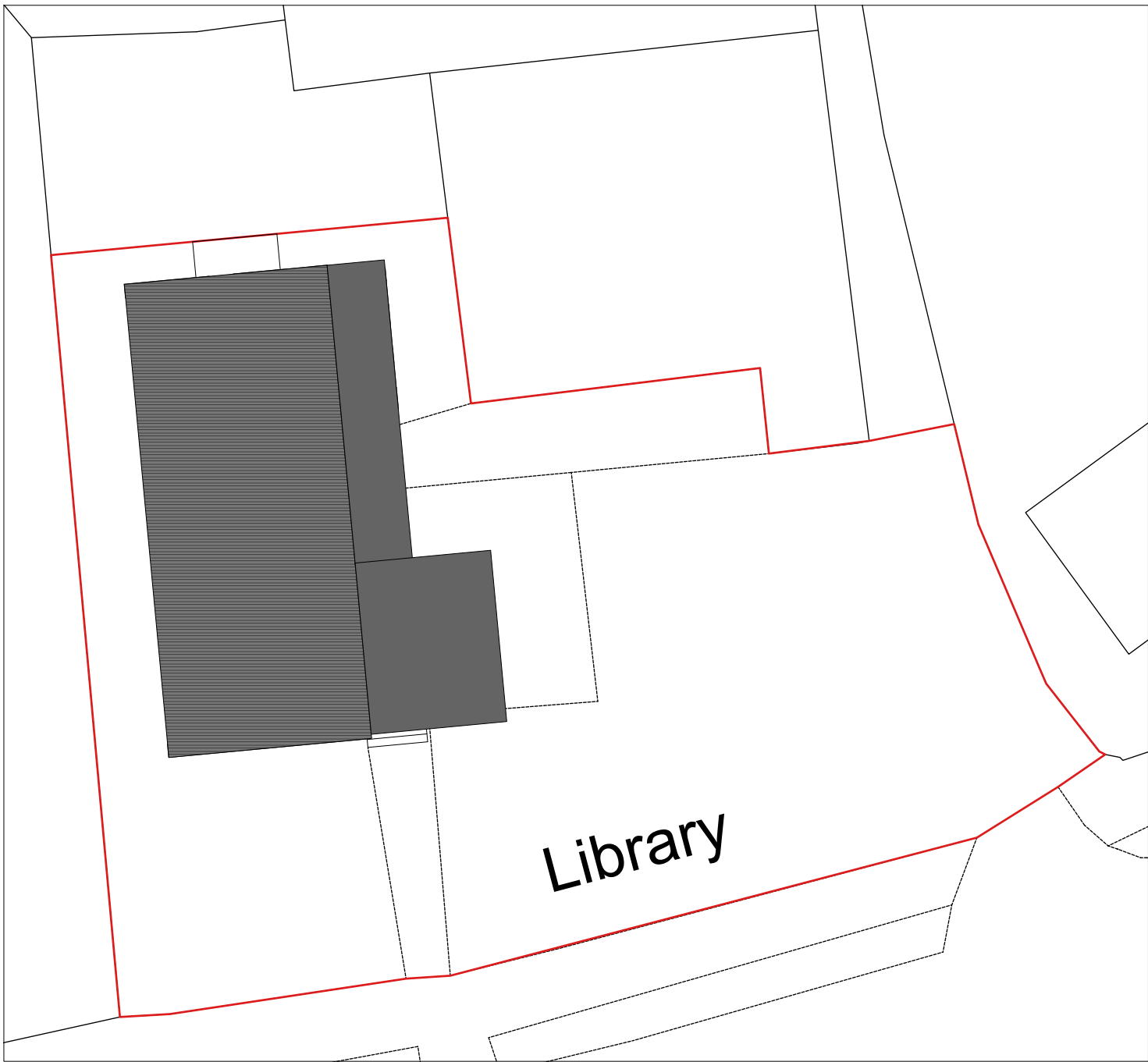
As Existing Roof Plan