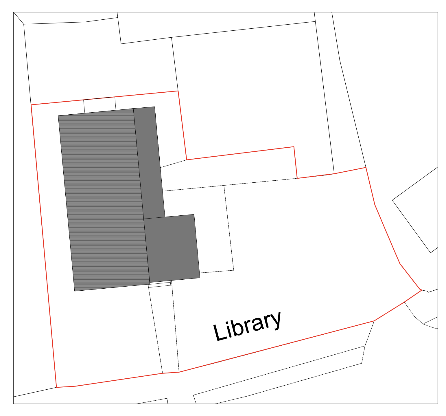
As Existing Roof Plan