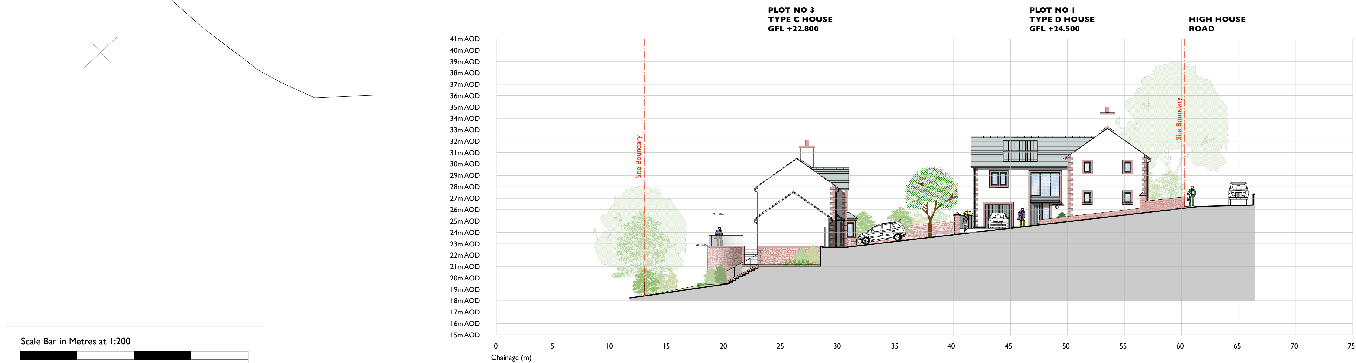
Proposed Site Plan 1:200