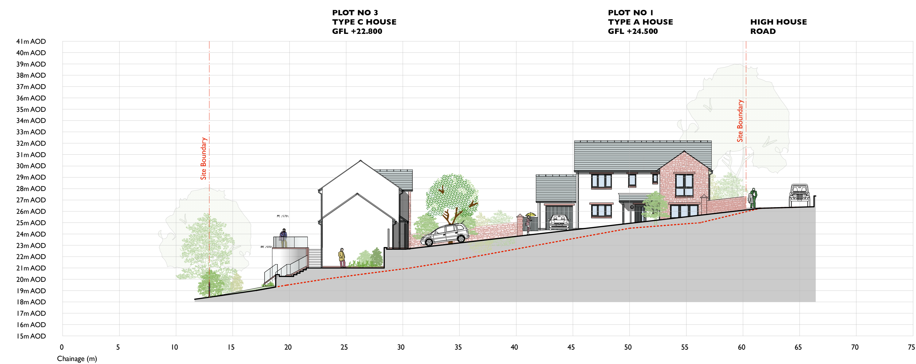
Proposed Section Through the Site at X:X 1:200