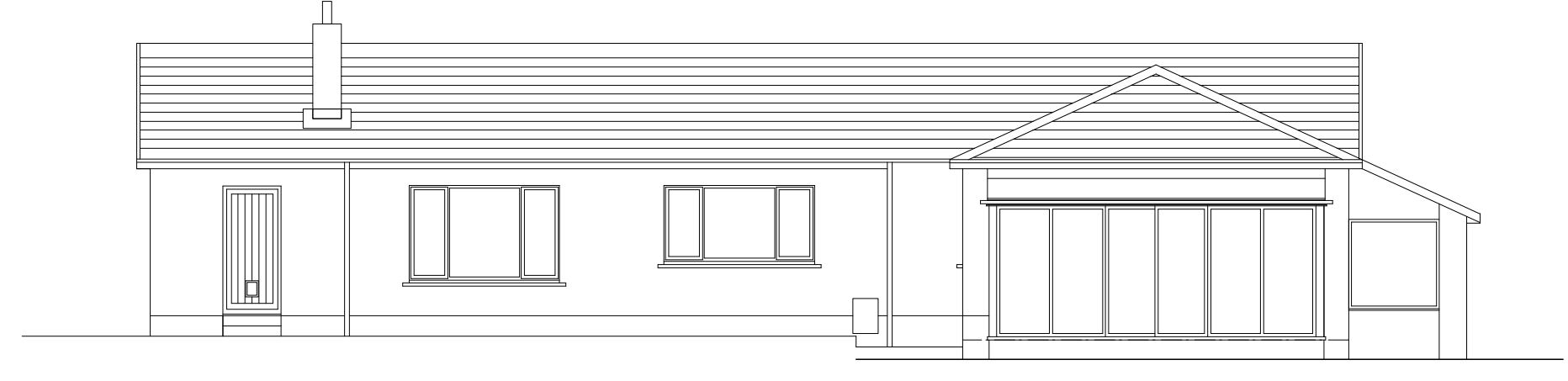
EXISTING REAR (WEST) ELEVATION