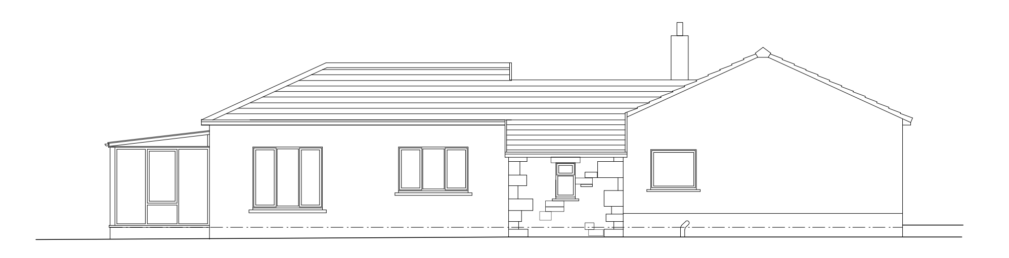
EXISTING SIDE (SOUTH) ELEVATION