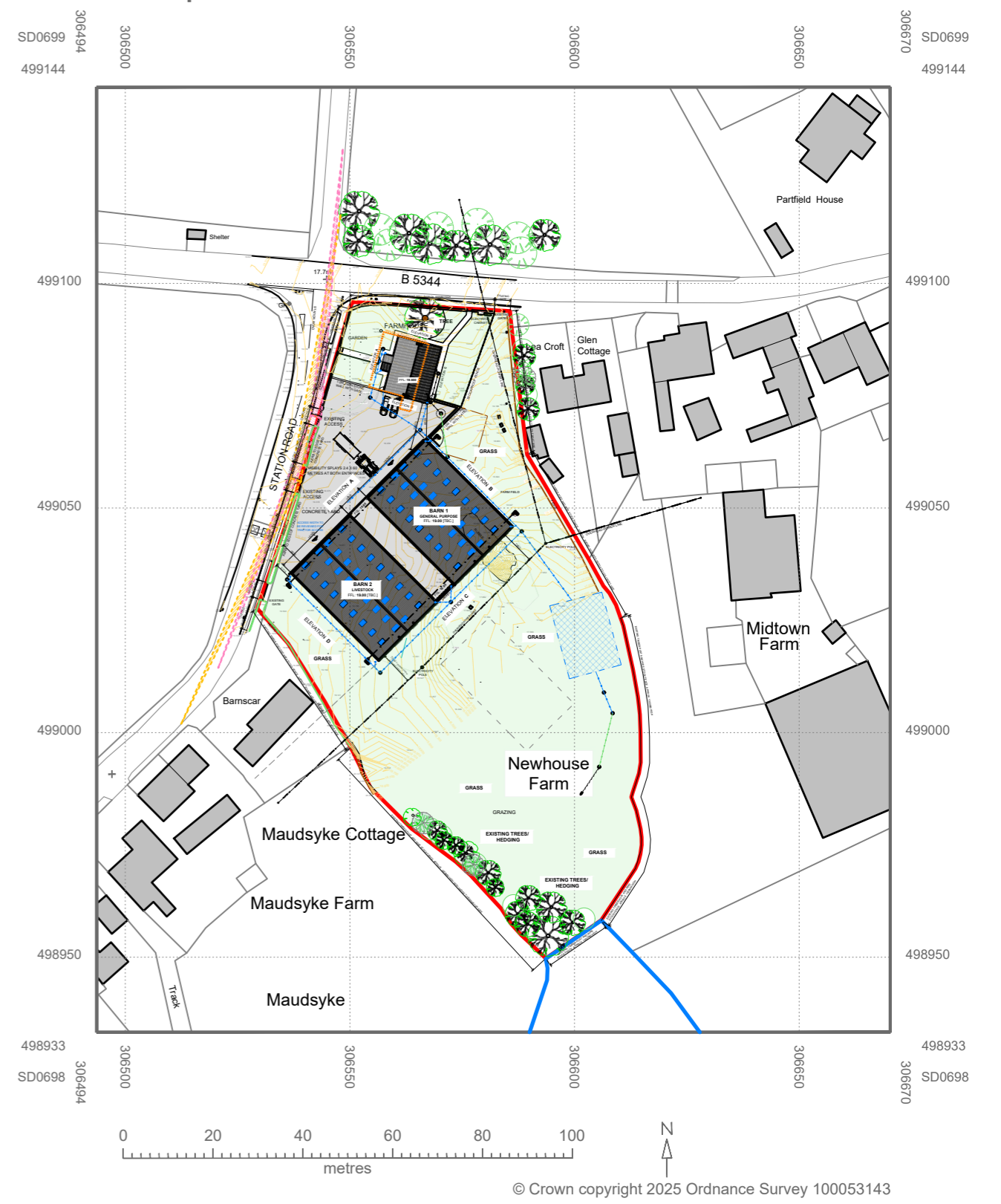
LOCATION PLAN SCALE: 1/1250