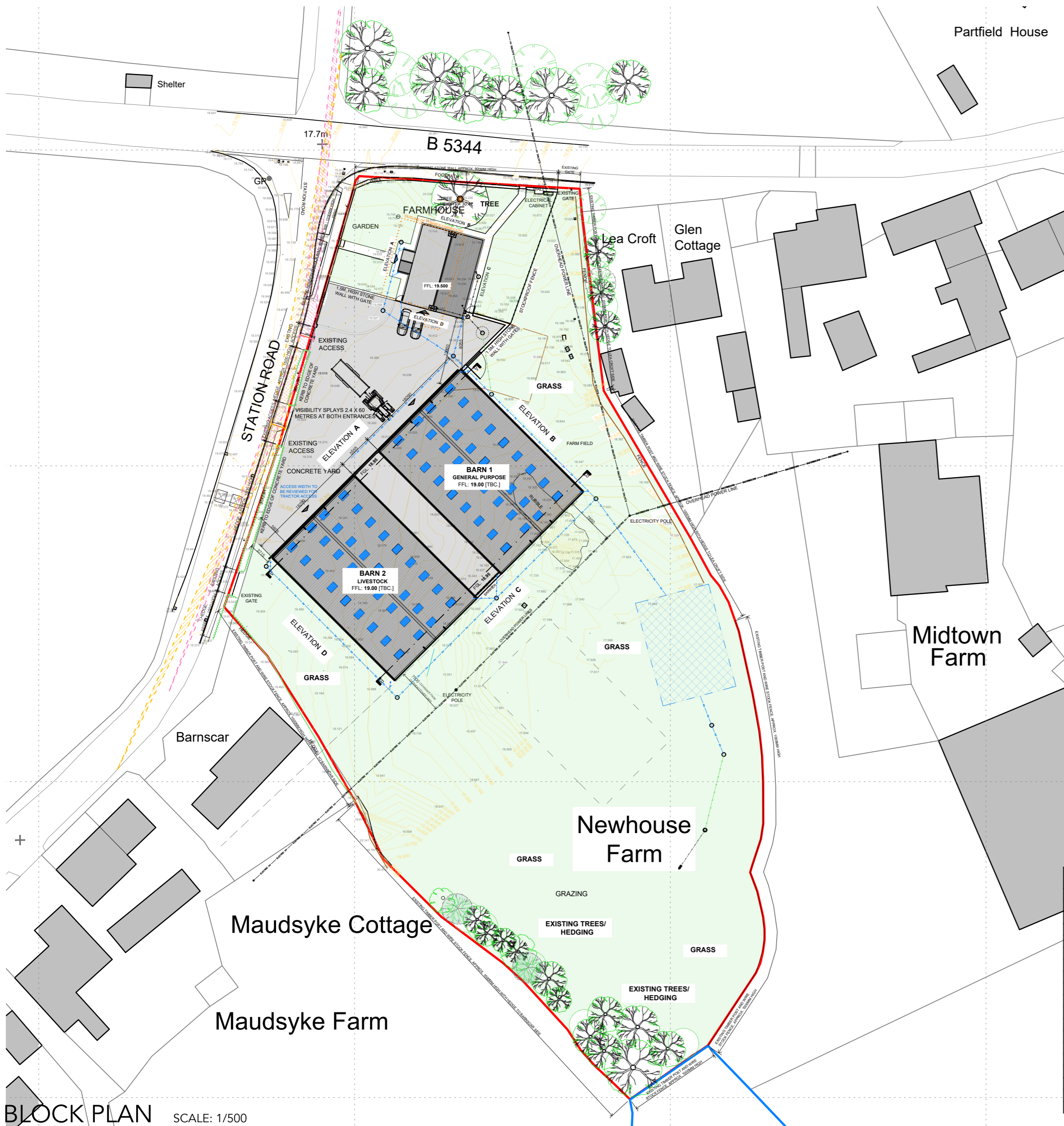
BLOCK PLAN SCALE: 1/500 1 : 500