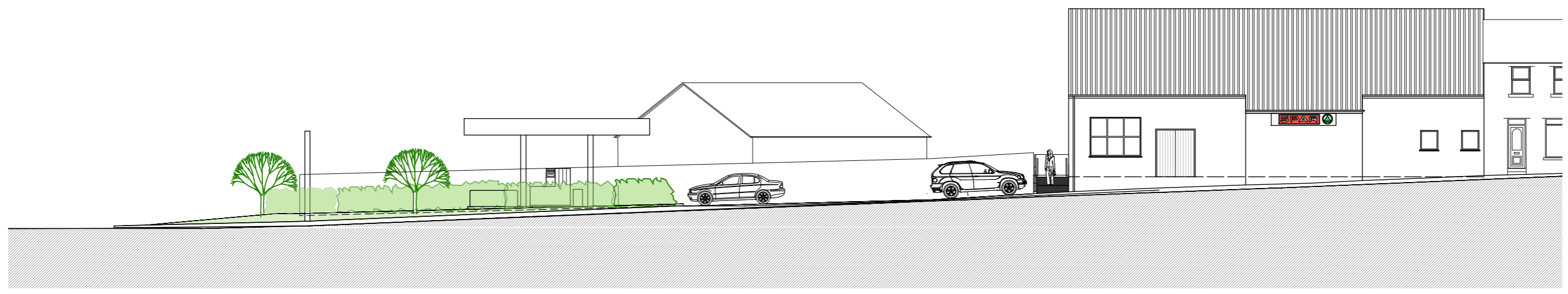
MAIN STREET ELEVATION 0 1 2 3 4 5 6 7 8 9 10 10 metre scale bar