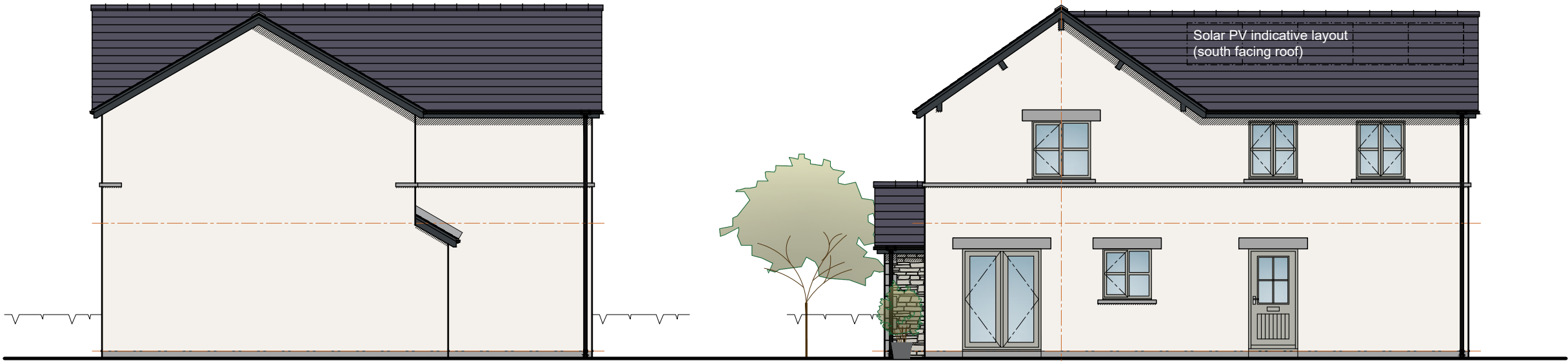
REAR ELEVATION (EAST) Scale 1:100