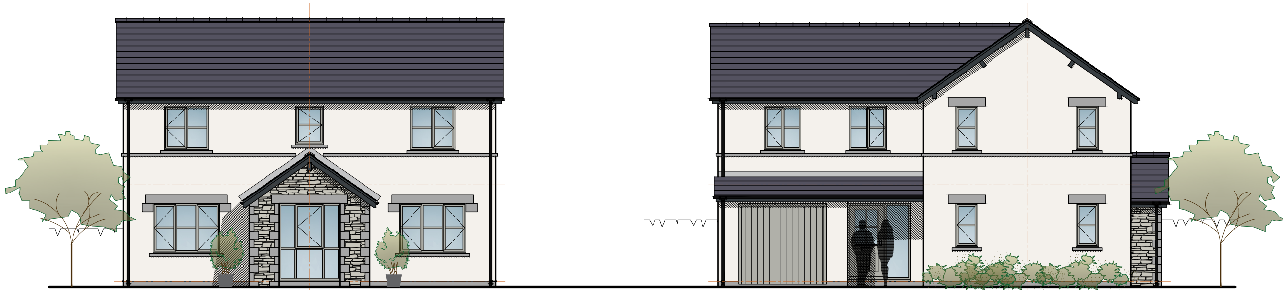
FRONT ELEVATION TO SALTHOUSE ROAD (WEST) Scale 1:100