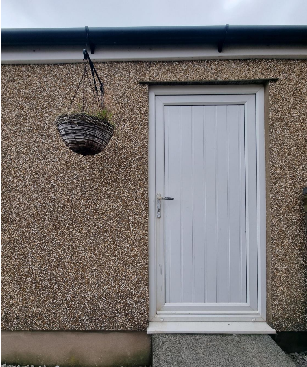
Outside of the entrance door to the dog grooming room.