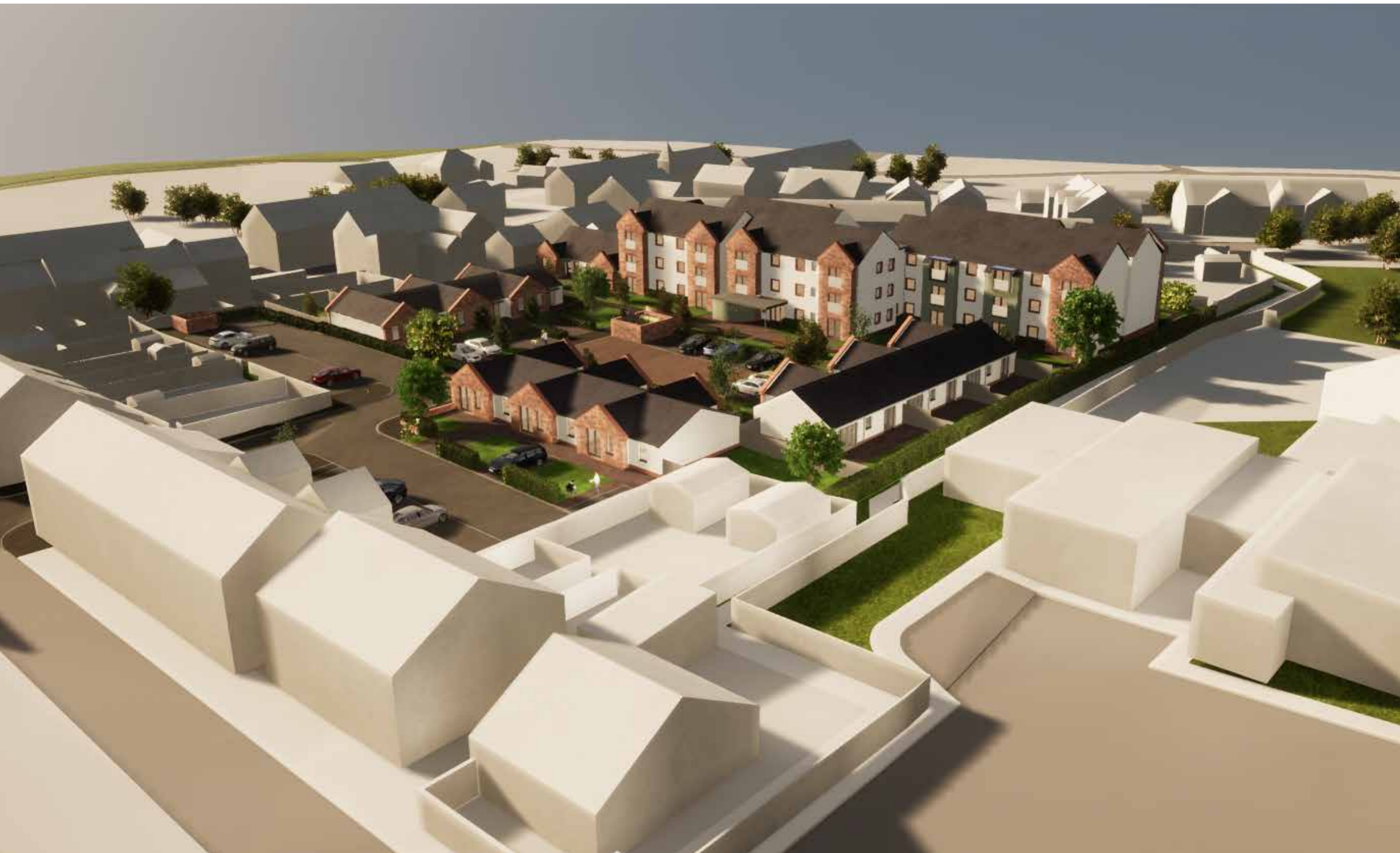
VIEW ACROSS SITE FROM CHURCH ROAD