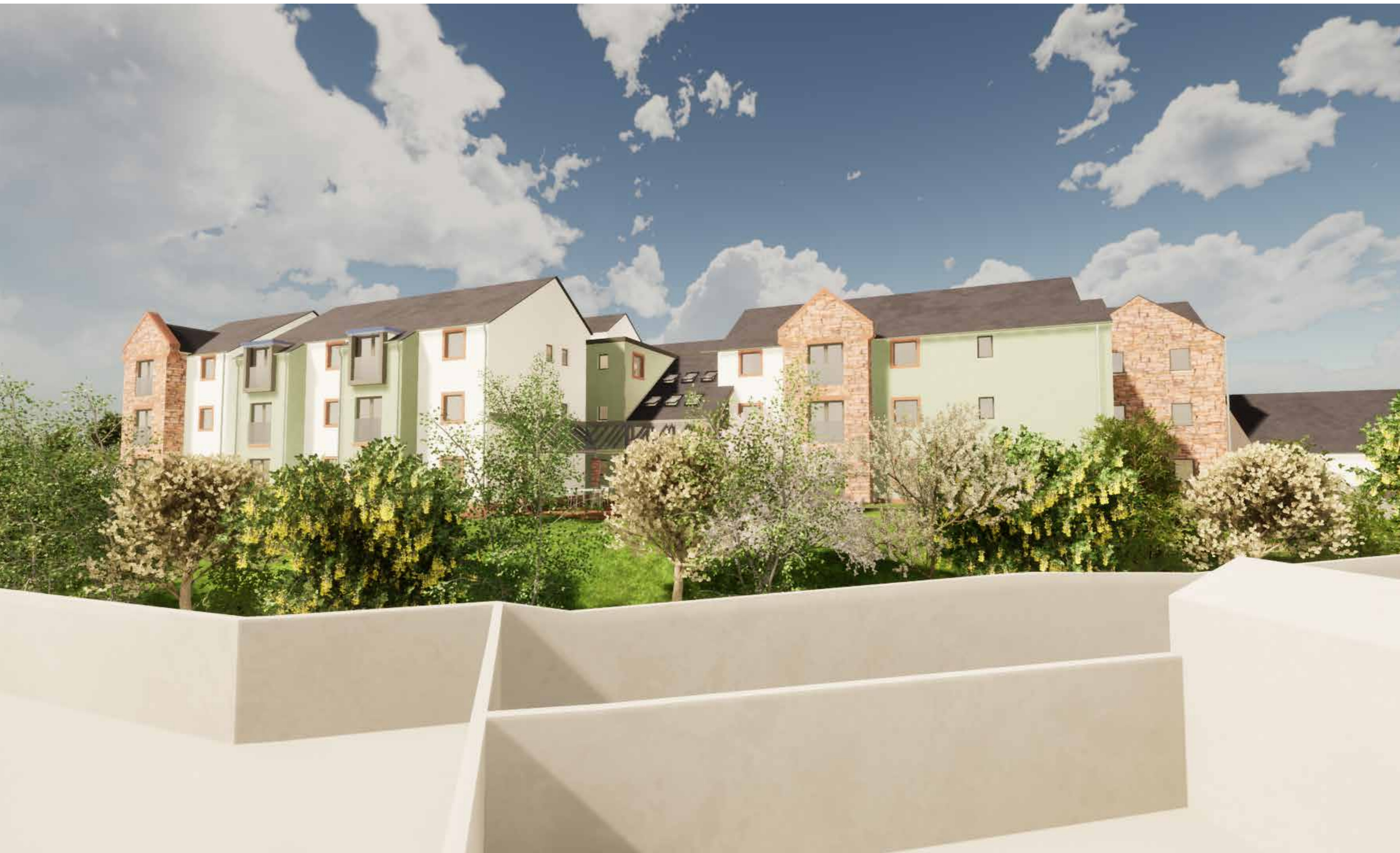
VIEW FROM CHAPEL STREET