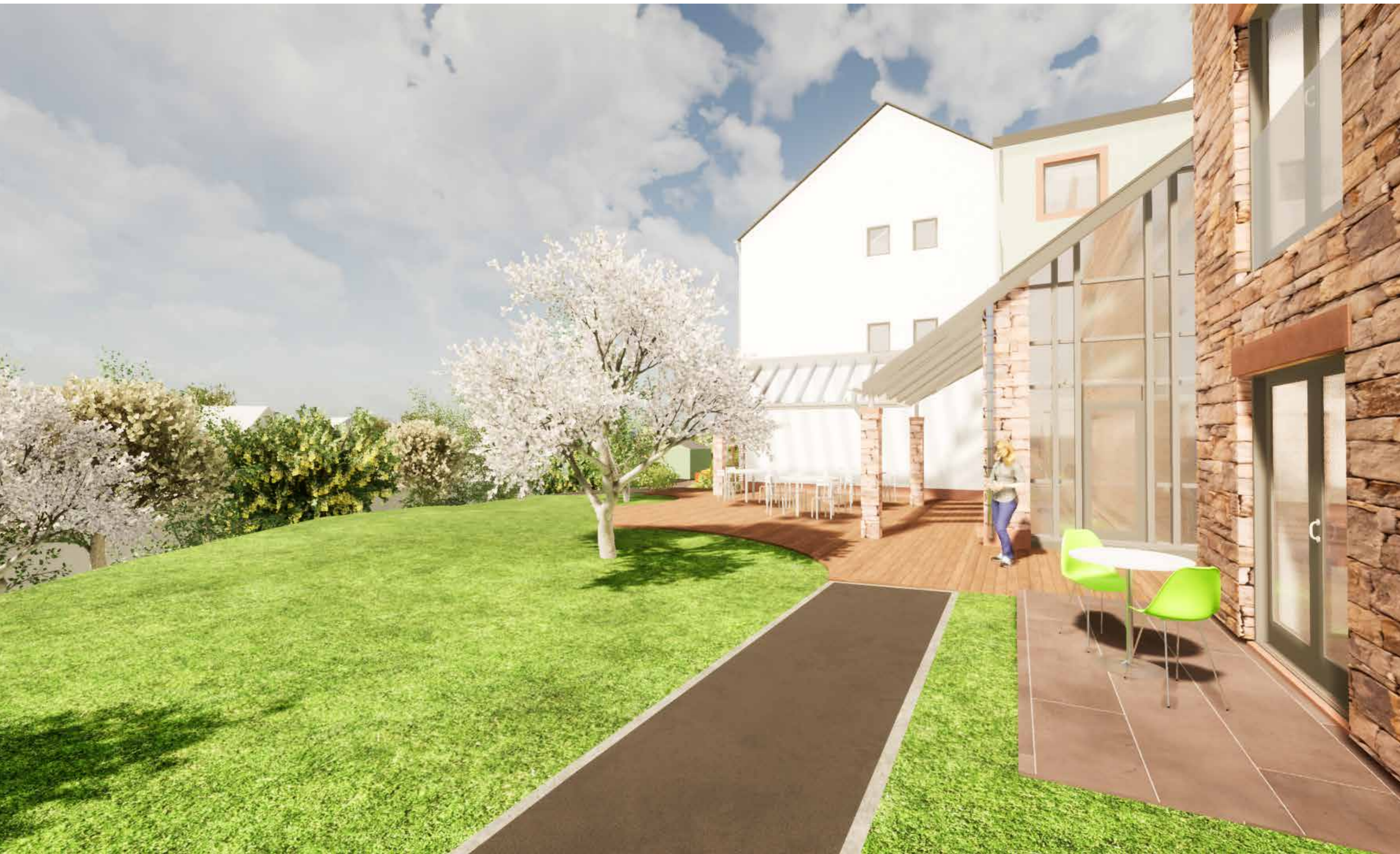
VIEW TO REAR PATIO AREA