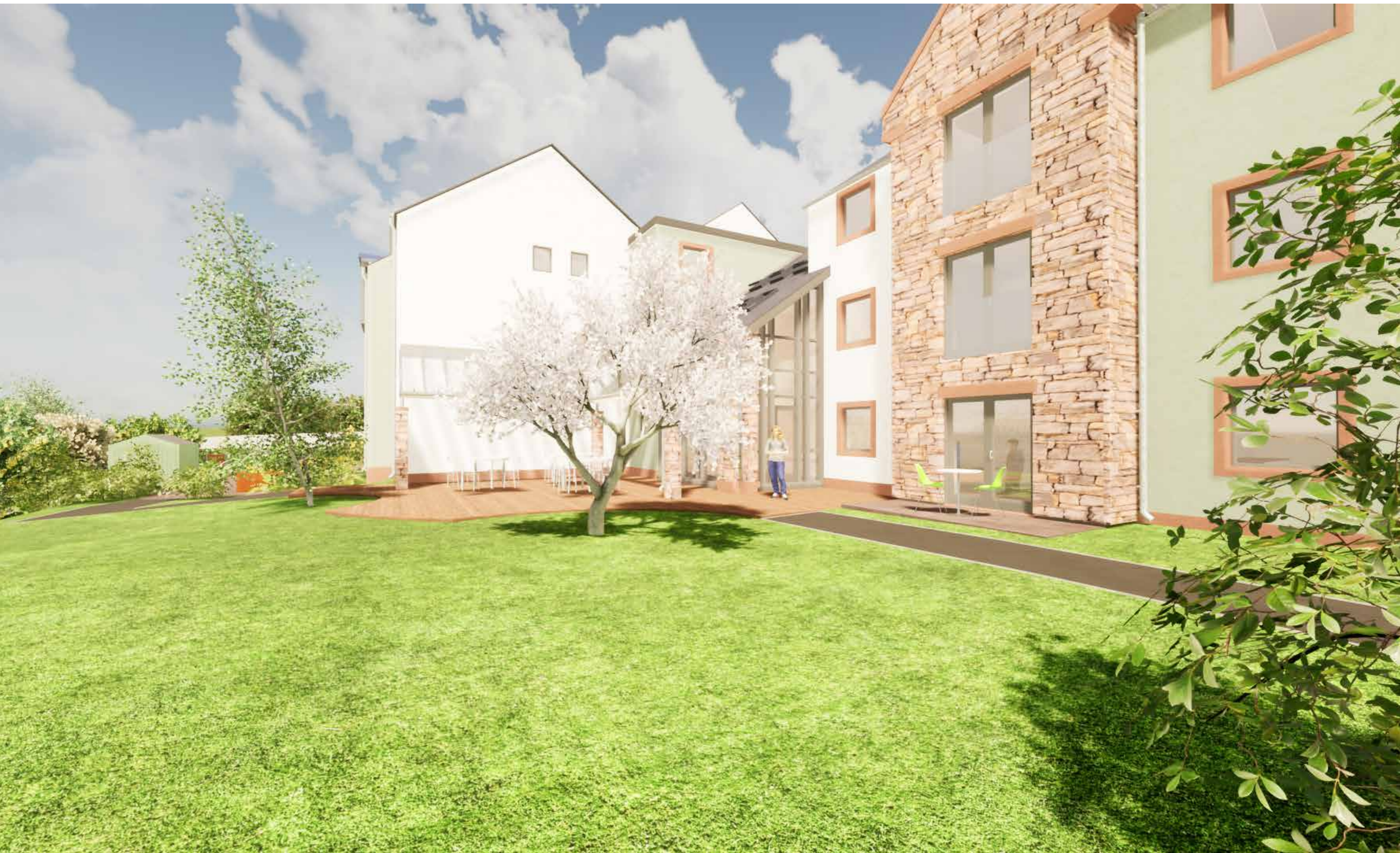
VIEW TO REAR PATIO AREA