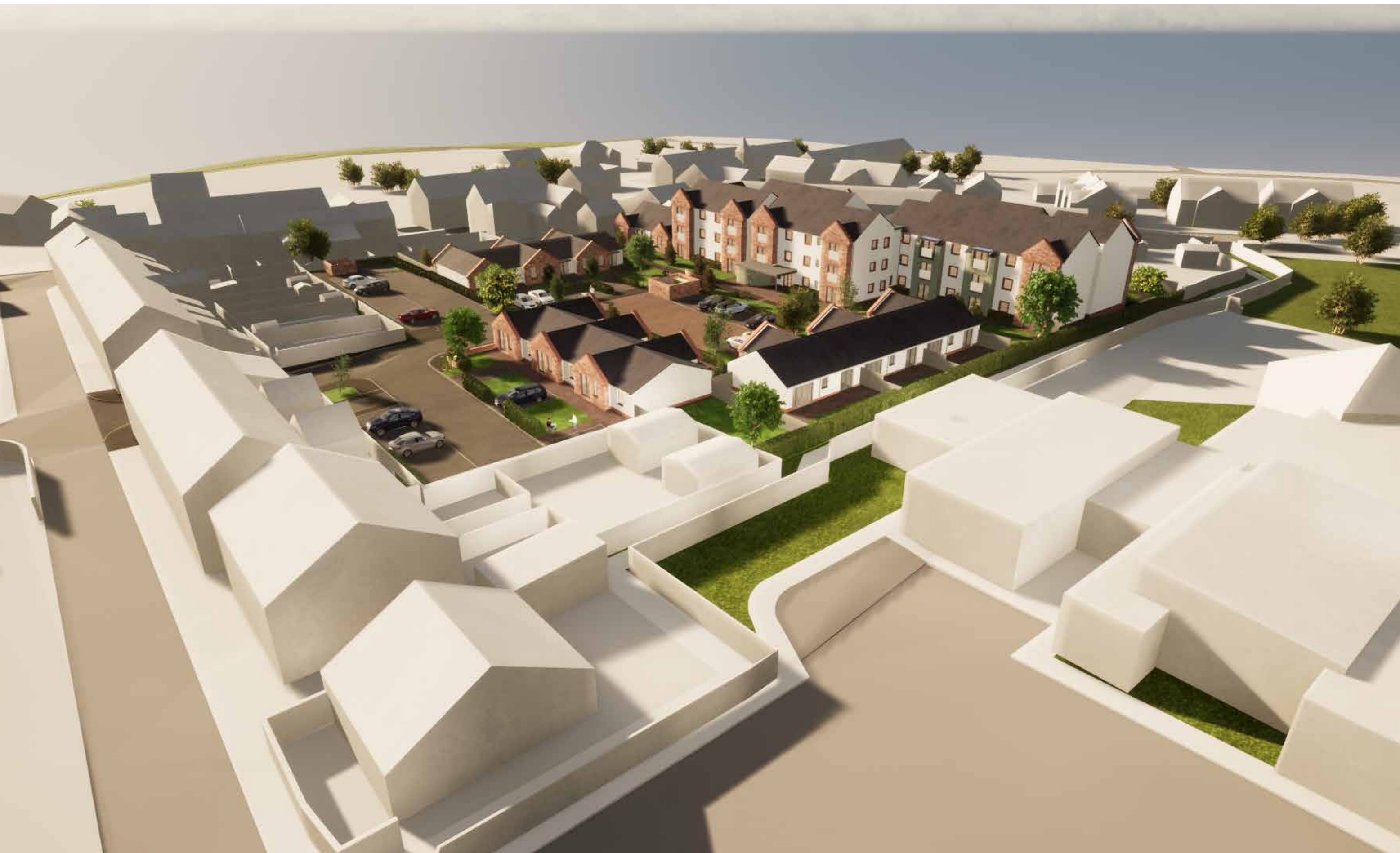
VIEW ACROSS SITE FROM CHURCH ROAD