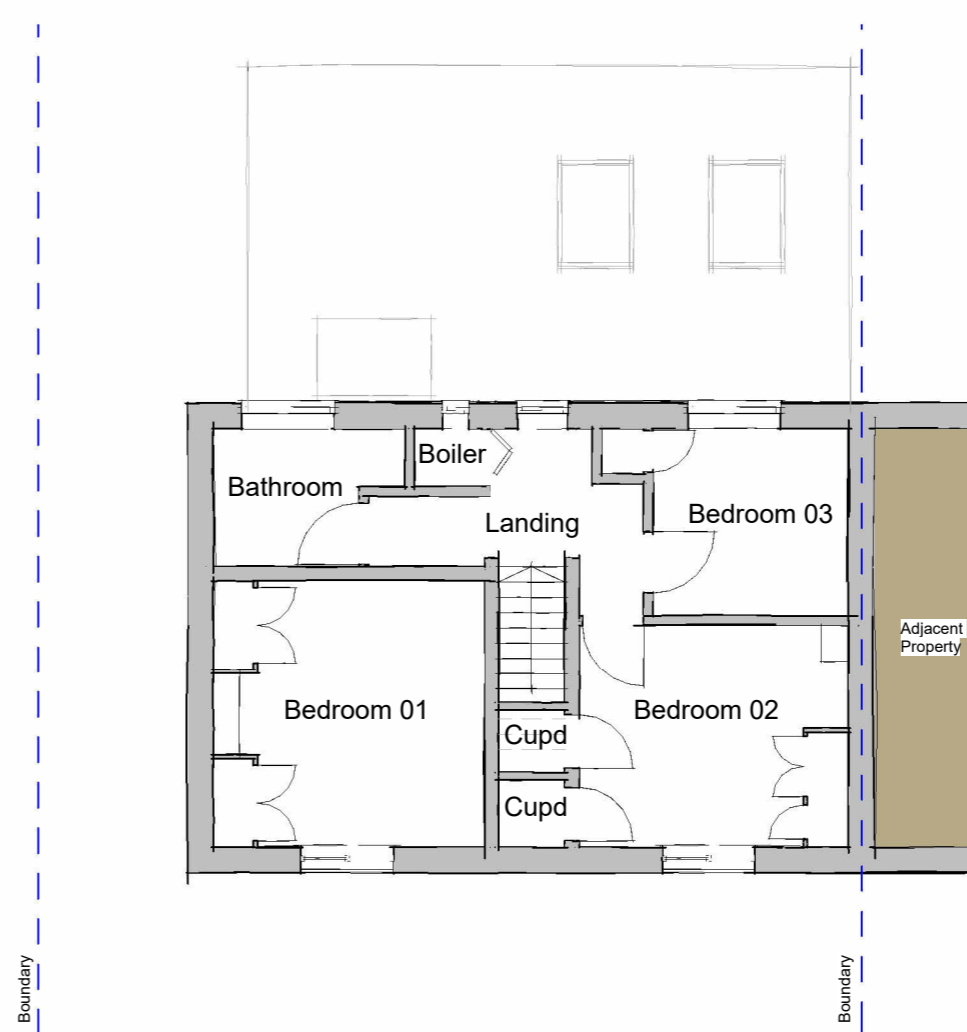
First 1 : 100