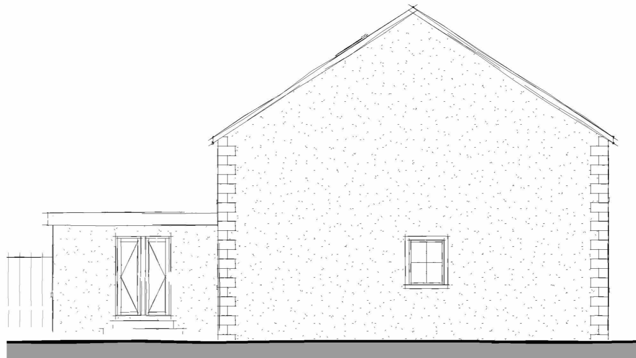
Side Elevation 01